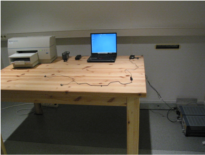
Picture 3 AC powerline conducted emission measurement 15B