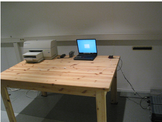
Picture 4 AC powerline conducted emission measurement 15B