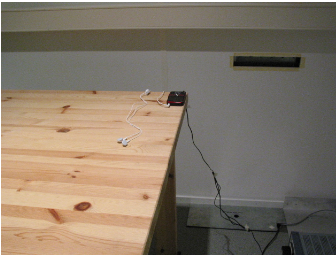
Picture 3 AC powerline conducted emission measurement 15C