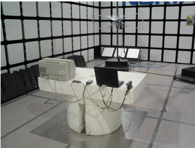
Picture 2 Radiated emission 15B