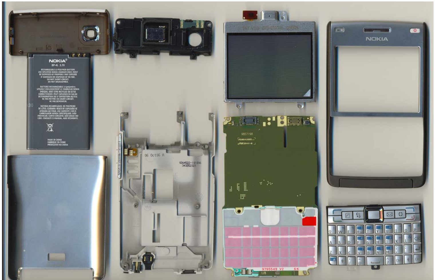
Exhibit 09: Internal Photos BT/WLAN