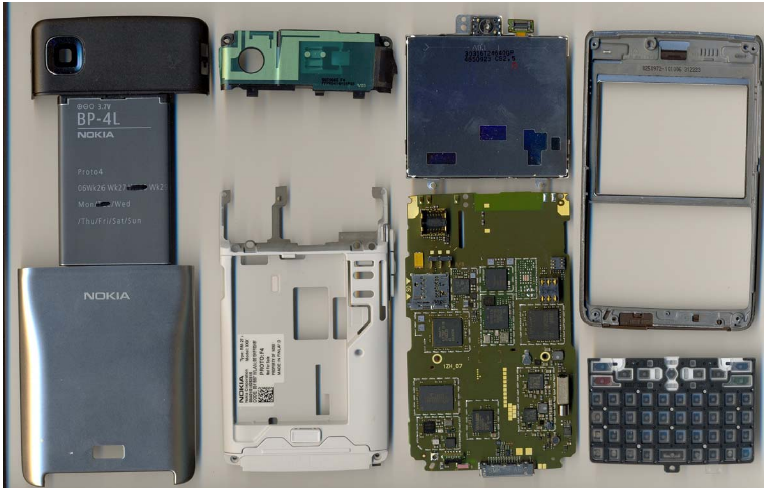
Exhibit 09: Internal Photos BT/WLAN