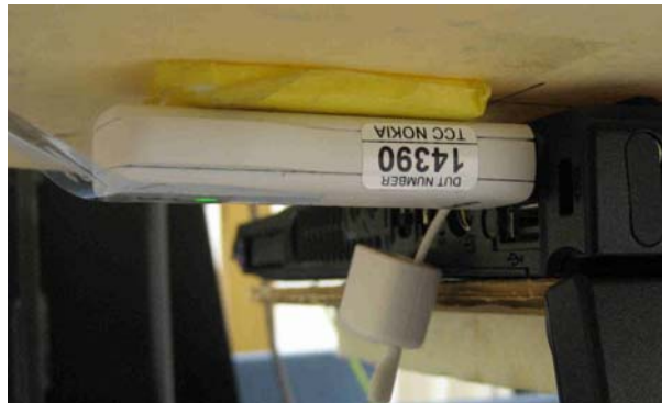
Device directly connected to a horizontal USB port of the IBM laptop computer, side 1 facing the phantom. The 0.5 cm spacer was removed before the test.

The device was placed below the flat section of the phantom. The distance between the device and the phantom was kept at the separation distance of 0.5 cm using a flat spacer that was removed before starting the measurements. The device was oriented with all five sides facing the phantom to find the highest result. Two of the orientations were tested with device directly connected to a horizontal or to a vertical USB port of the laptop computer positioned against the phantom, and the other three orientations were tested with the device connected to the laptop computer using the high quality USB cable assembly CA-175D.