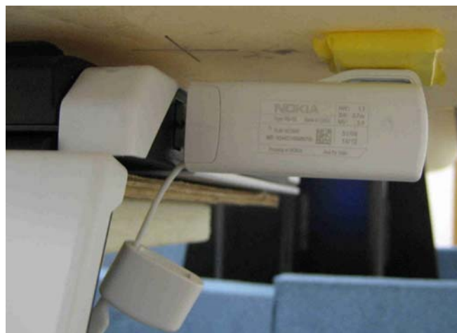
Device directly connected to a vertical USB port of the Amilo laptop computer, side 4 facing the phantom. The 0.5 cm spacer was removed before the test.