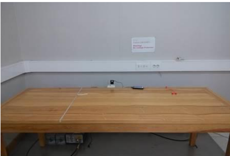
Picture 4. FCC Part 15C AC powerline conducted emissions