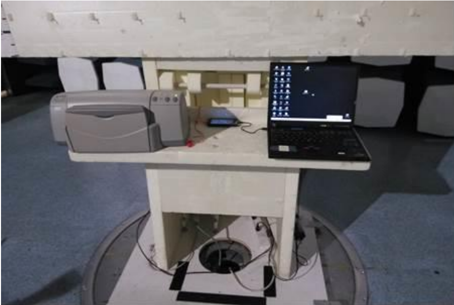
Picture 3. FCC Part 15B Radiated emissions, computer peripherals