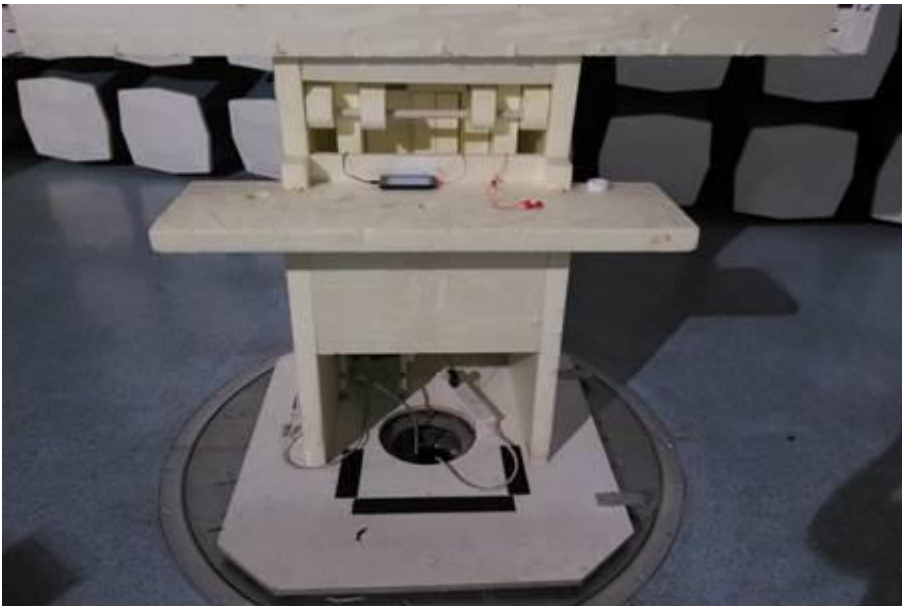
Picture 2. FCC Part 15B Radiated emissions