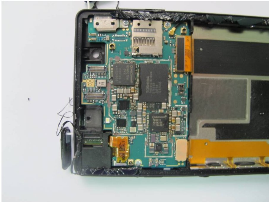
Mobile Phone Disassembly