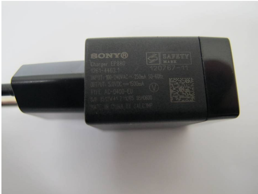
Label of Travel Charger