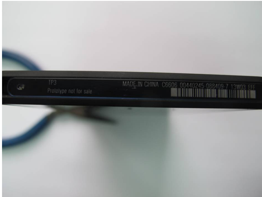
Label of Mobile Phone