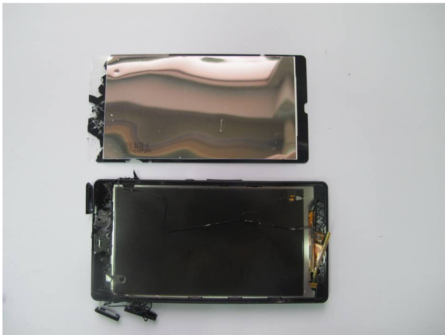
Mobile Phone Disassembly