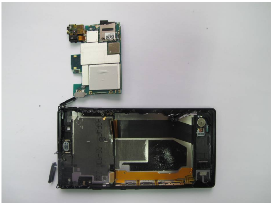
Mobile Phone Disassembly