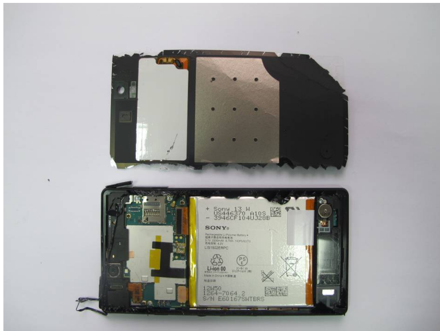
Mobile Phone Disassembly