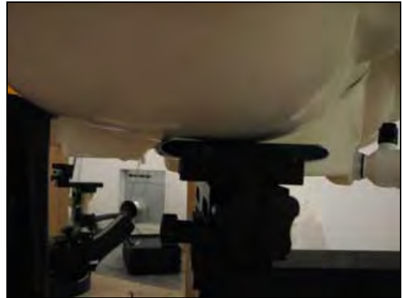
DUT position towards the head: Cheek (touch) position