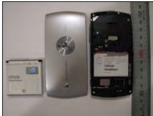
Back side with battery