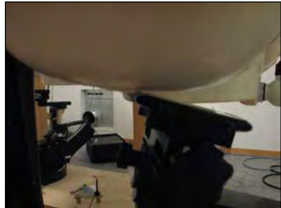
DUT position towards the head: Tilt (touch +15 deg.) position