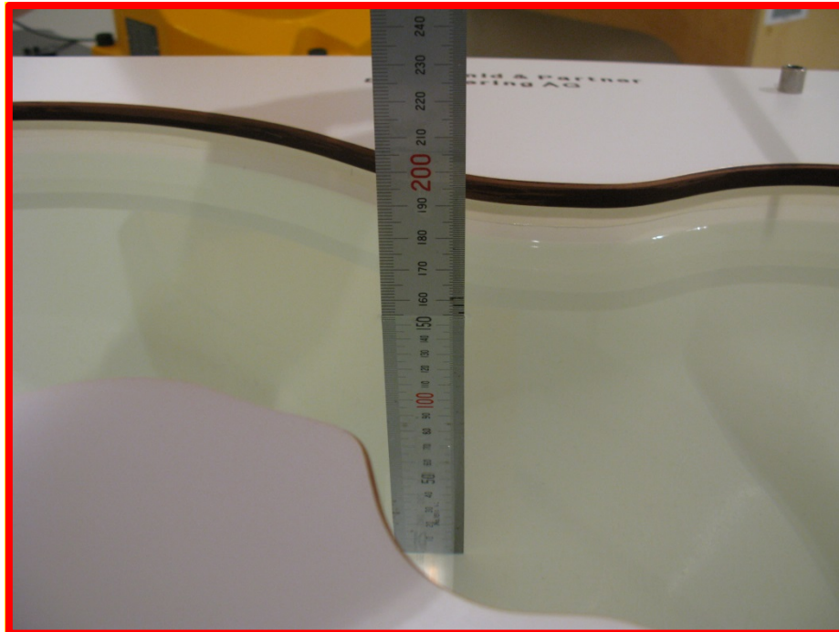
Photograph I3.1 – MSL2450V2 LB000182AA Fluid Level at Test Position 2015-01-15