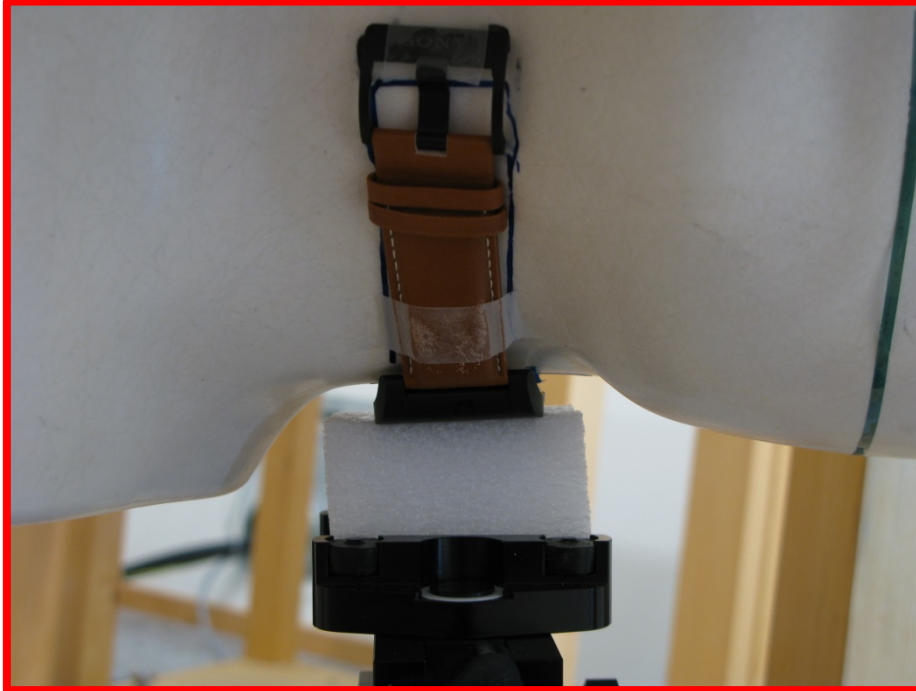
Photograph I2.2 – Back of the Device Placed Against the Phantom – Alternate View Special Neck Position / 1294-5702 (Carrier) and 1276-4067 (Leather Band)