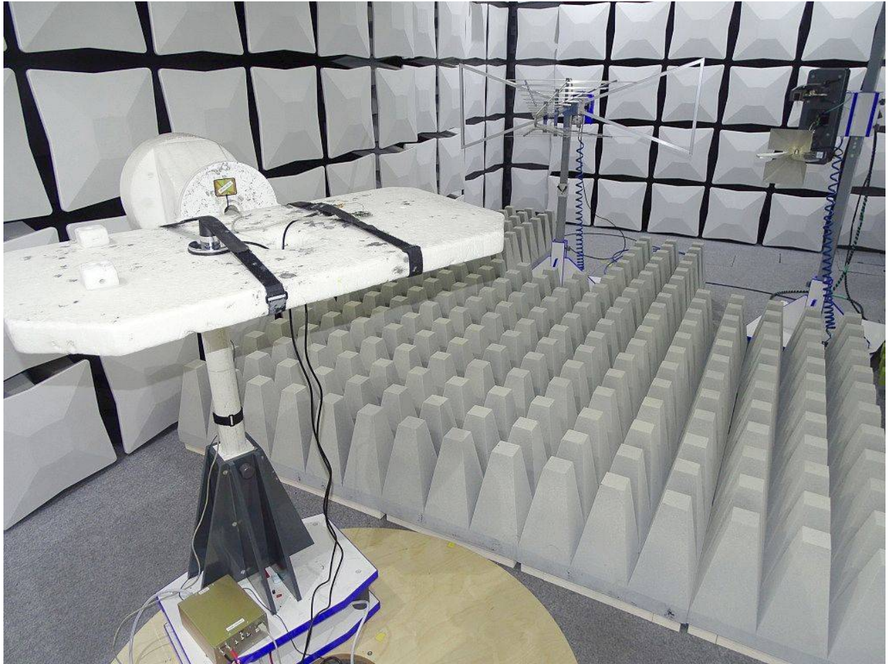
Photo 1: Test setup for radiated measurements (Enclosure, fully-anechoic chamber, 1-26 GHz intentional radiator §15, ANSI C63.10)