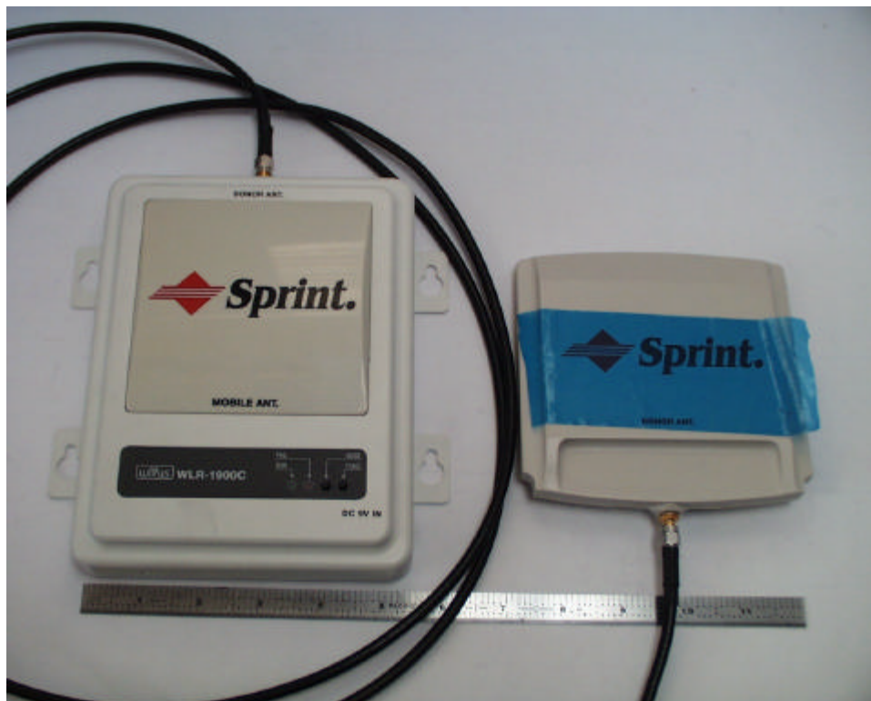
External Photograph for WLR-1900C