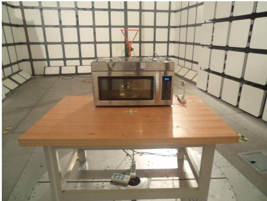
Radiated Emissions (30 MHz to 1GHz) - Rear View