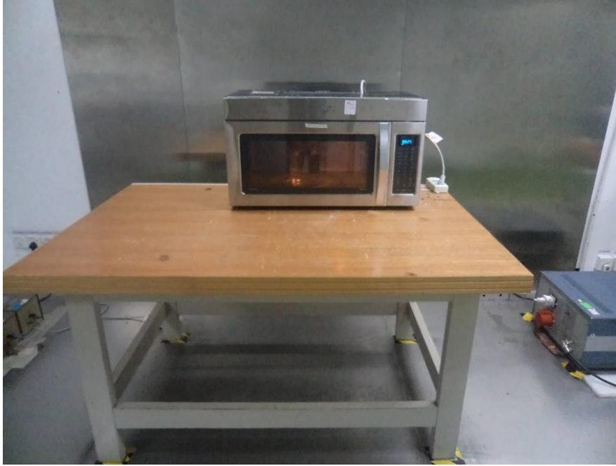
Conduction Emissions – Side View