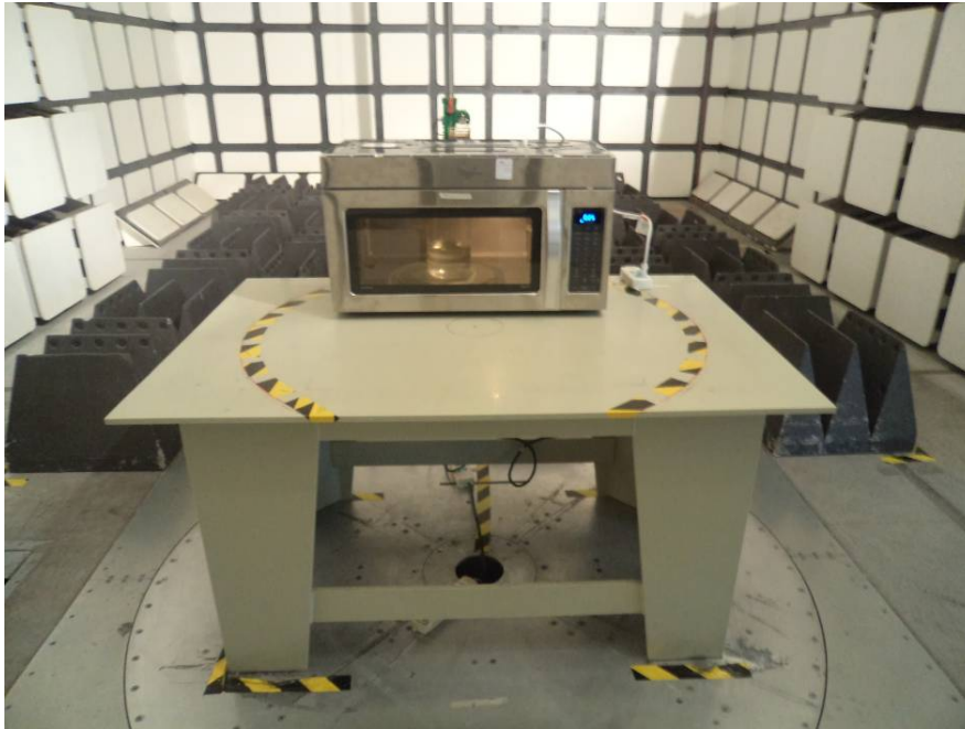
Radiated Emissions (1 GHz to 25 GHz) – Rear View