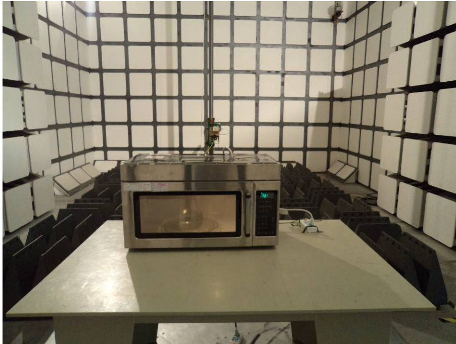
Radiated Emissions (1 GHz to 25 GHz) – Rear View