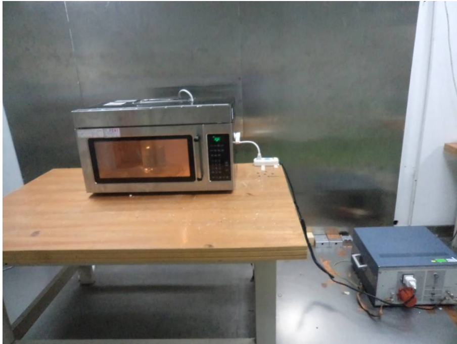
Conduction Emissions – Side View