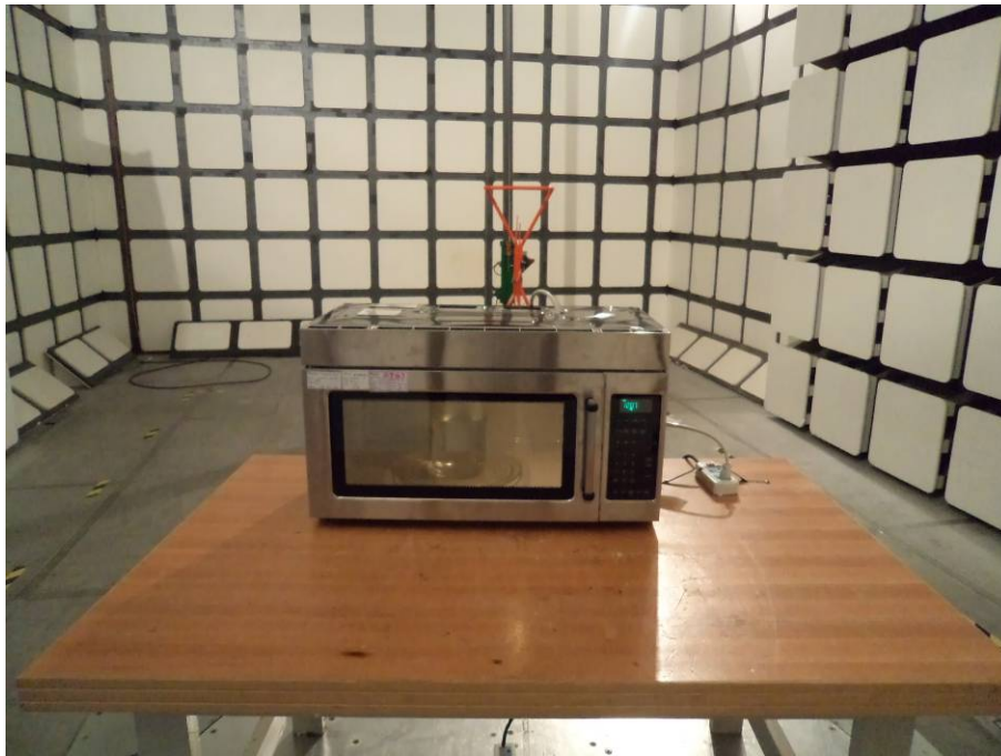
Radiated Emissions (30 MHz to 1GHz) - Rear View