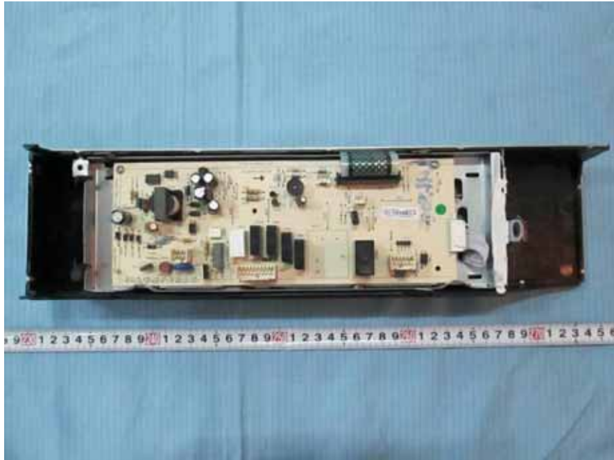
EUT –Control Panel Covered off View