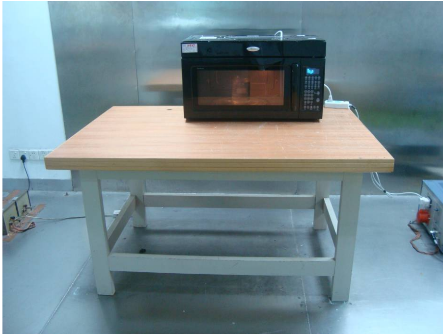
Conduction Emissions - Side View