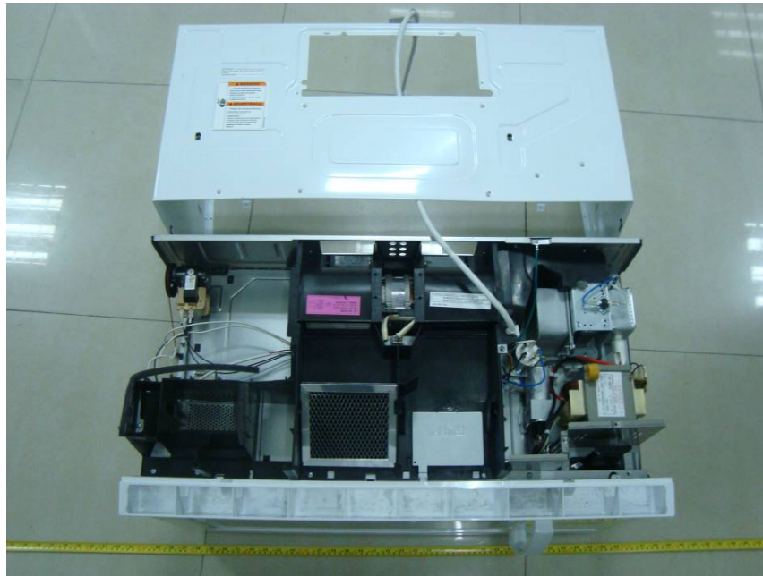
EUT - Cover off View

Following are the specification and photo: