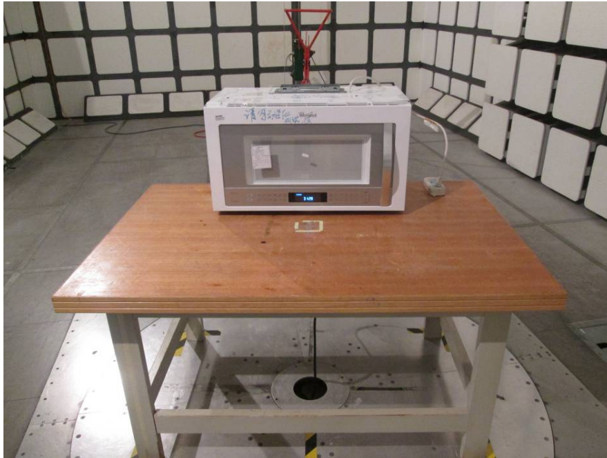
Radiated Emissions - Rear View (30 MHz – 1 GHz)