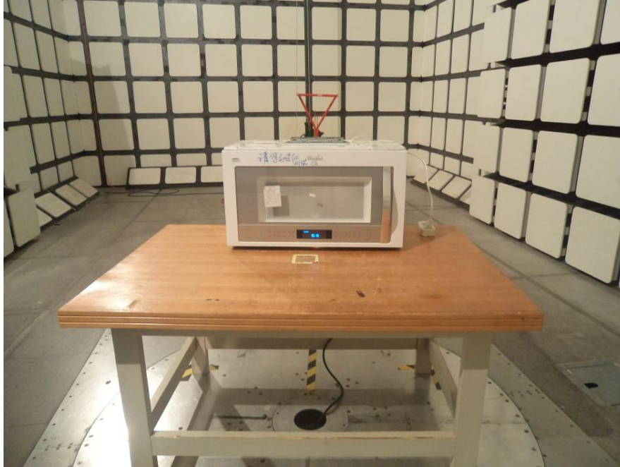
Radiated Emissions - Rear View (30 MHz – 1 GHz)