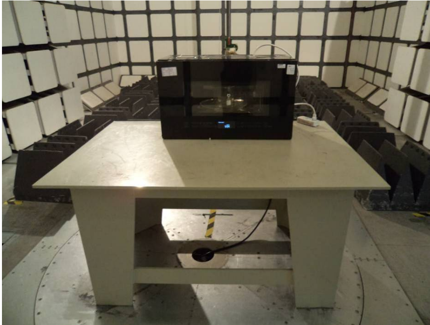
Radiated Emissions - Rear View (Above 1 GHz)