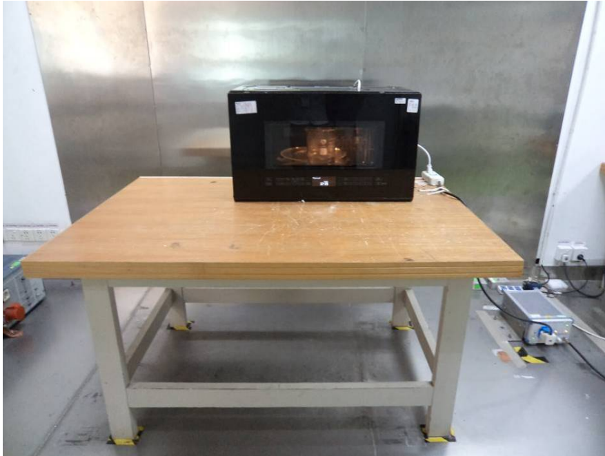
Conduction Emissions - Side View