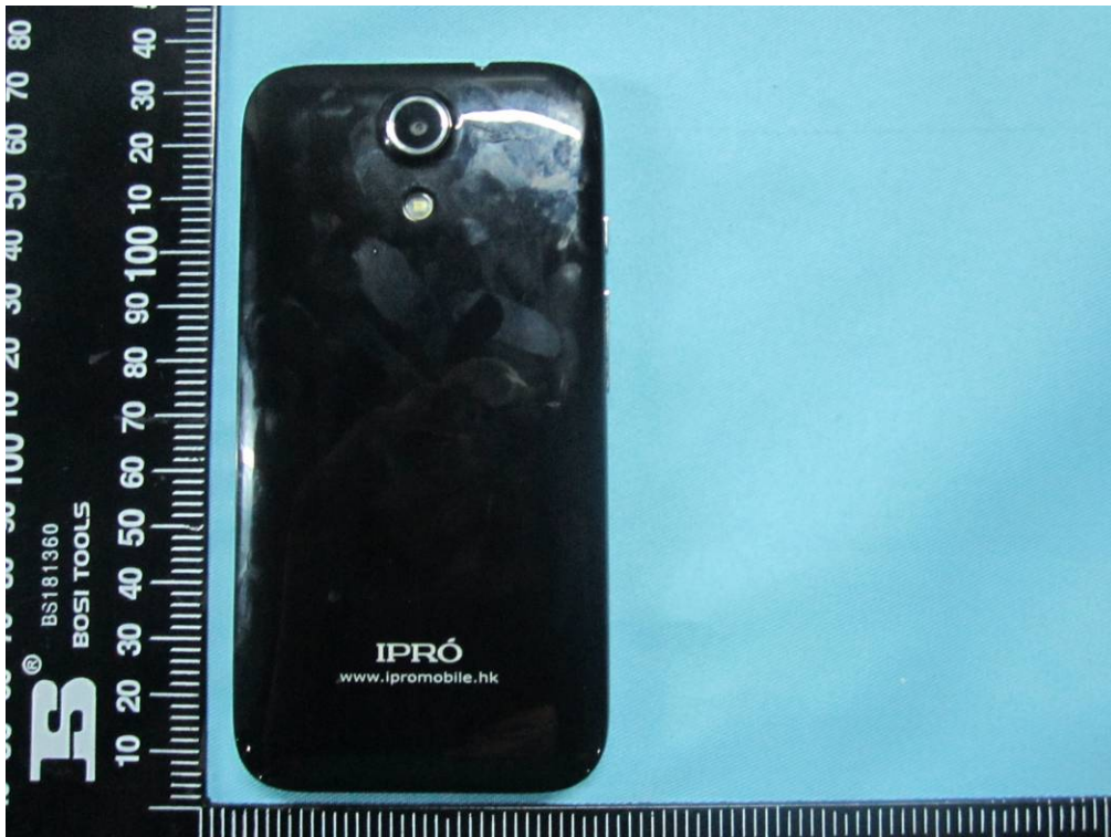
EUT - Rear View