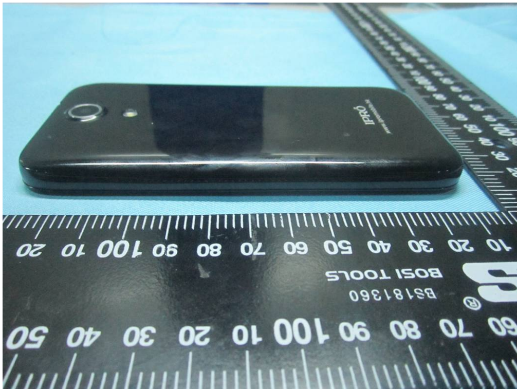
EUT - Right View