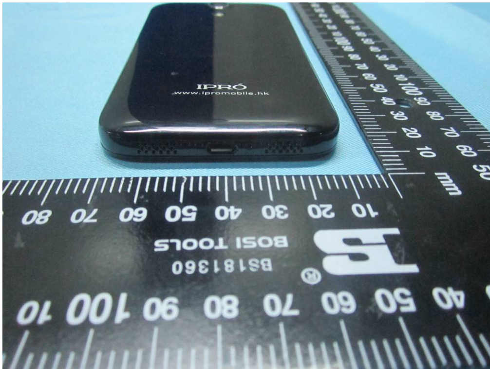
EUT - Bottom View