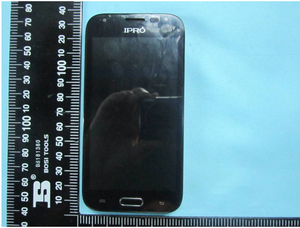
EUT - Front View

Report No.: 14070279-FCC-E1 Issue Date: June 23, 2014 Page: 20 of 37 www.siemic.com www.siemic.com.cn