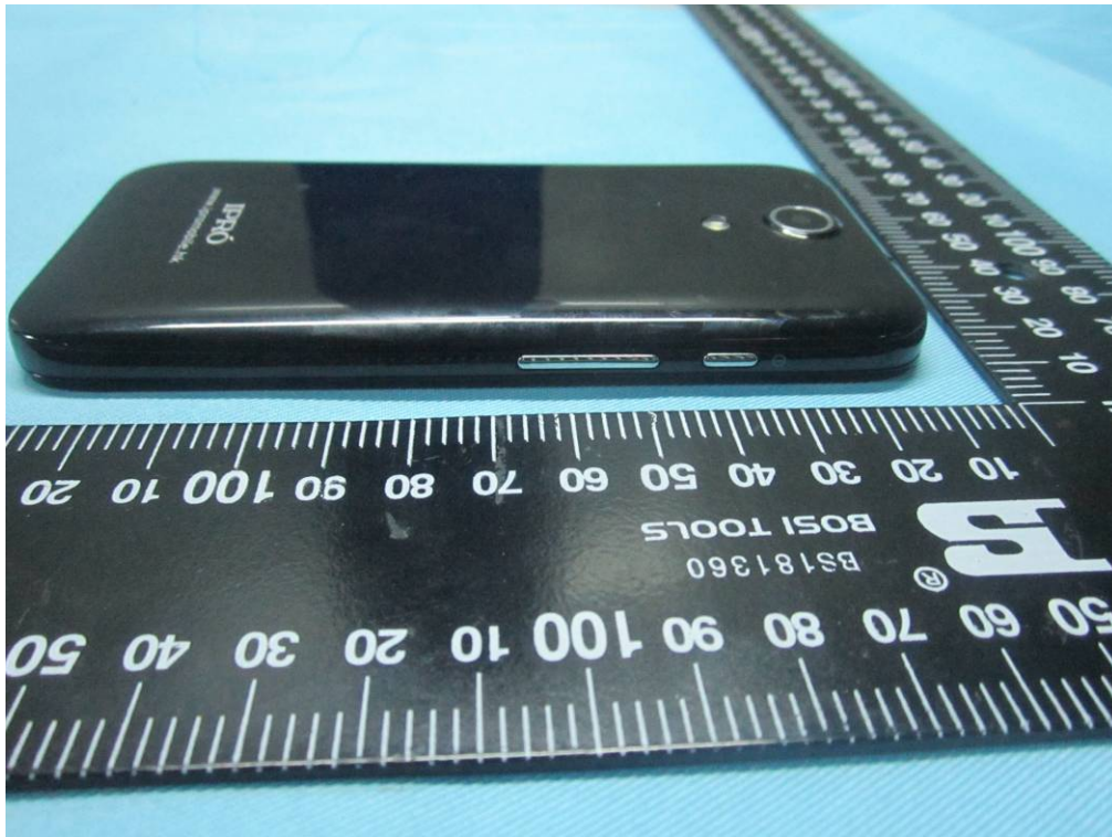
EUT - Left View

Report No.: 14070279-FCC-E1 Issue Date: June 23, 2014 Page: 22 of 37 www.siemic.com www.siemic.com.cn