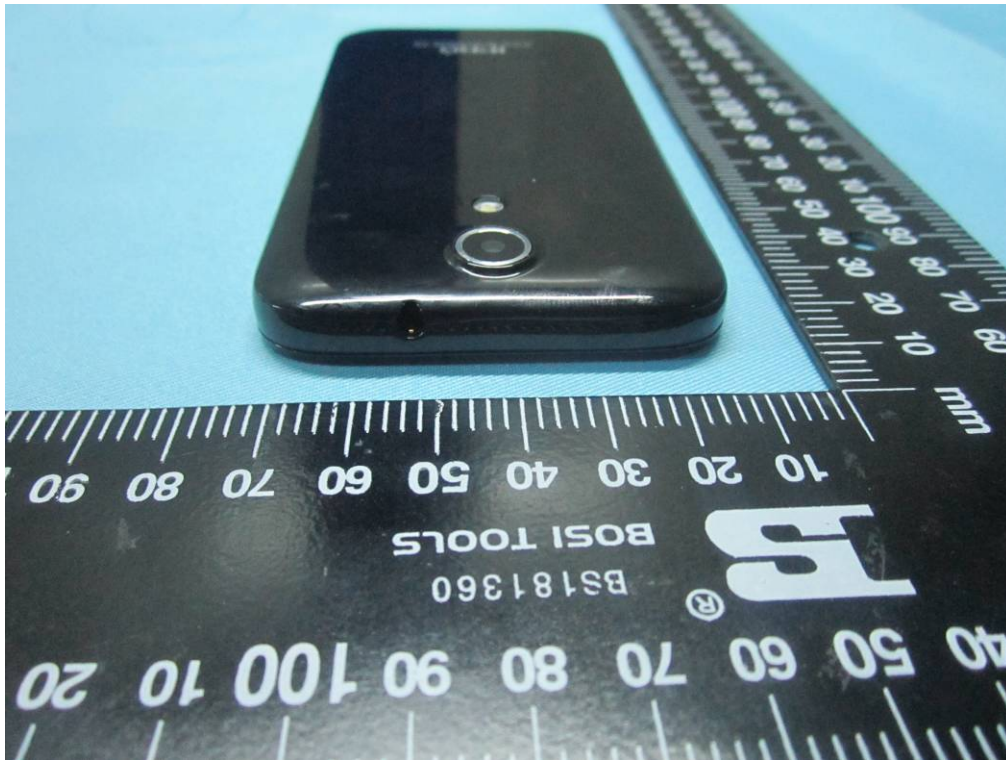
EUT - Top View

Report No.: 14070279-FCC-E1 Issue Date: June 23, 2014 Page: 21 of 37 www.siemic.com www.siemic.com.cn