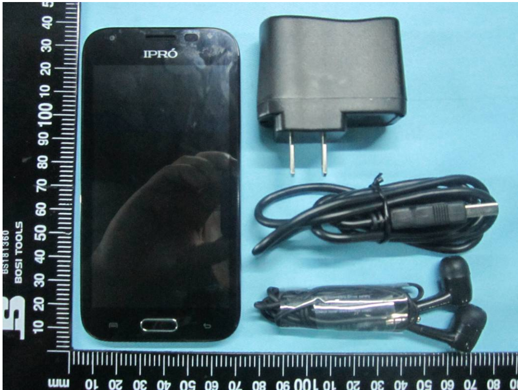
Whole Package - Top View