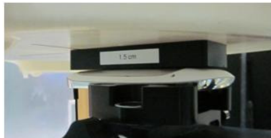
Photo of the device positioned for Body SAR measurement. The spacer was removed for the tests.

The device was placed in the SPEAG holder using the Nokia spacer and placed below the flat section of the phantom. The distance between the device and the phantom was kept at the separation distance indicated in the photo below using a separate flat spacer that was removed before the start of the measurements. The device was oriented with both sides facing the phantom to find the highest results.