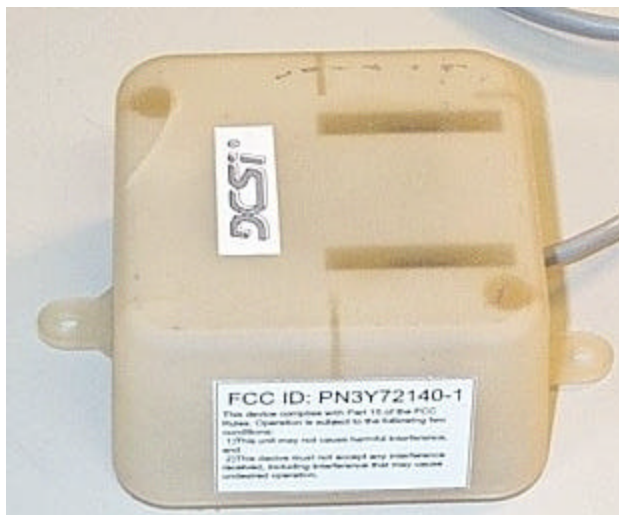
View of EUT showing Label Placement