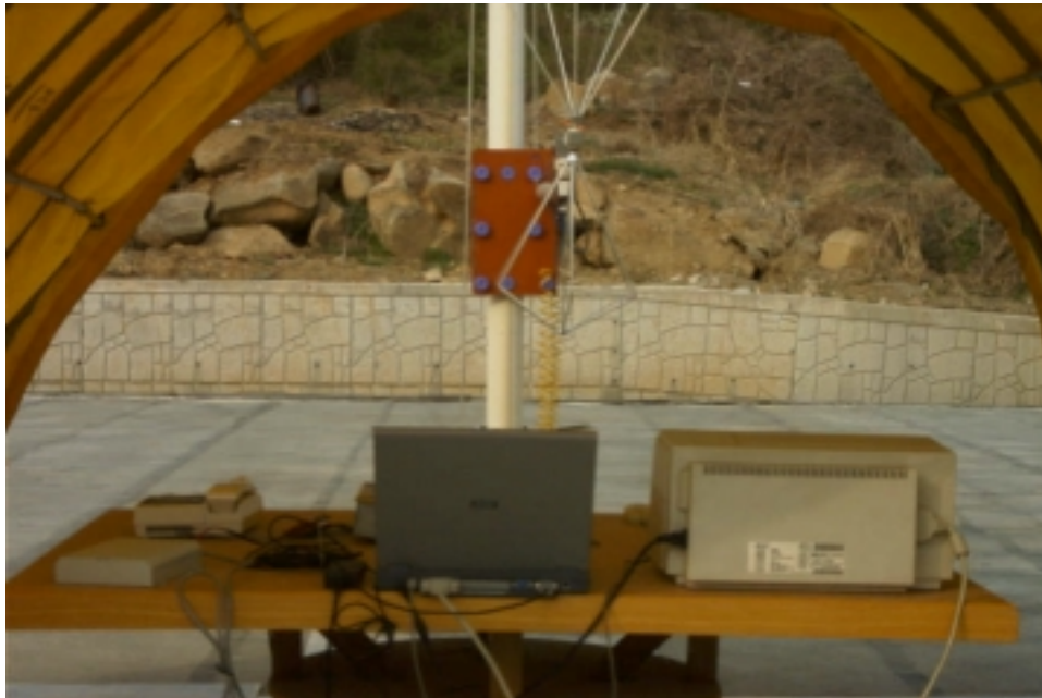
Photograph 1 : Setup for radiated Emissions