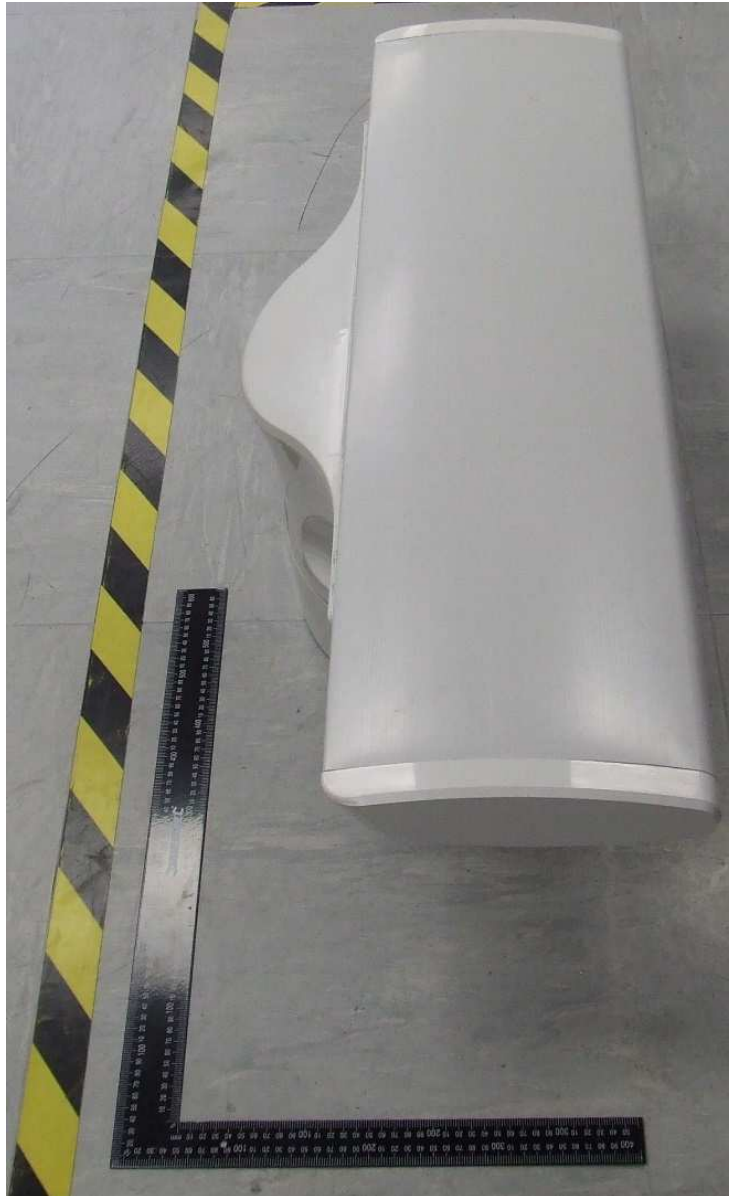
Figure 4 – Pedestal and 3ft antenna (right)