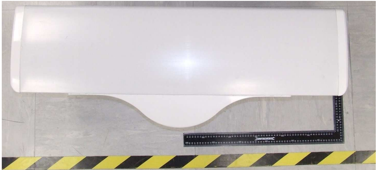
Figure 5 – Pedestal and 3ft antenna (top)