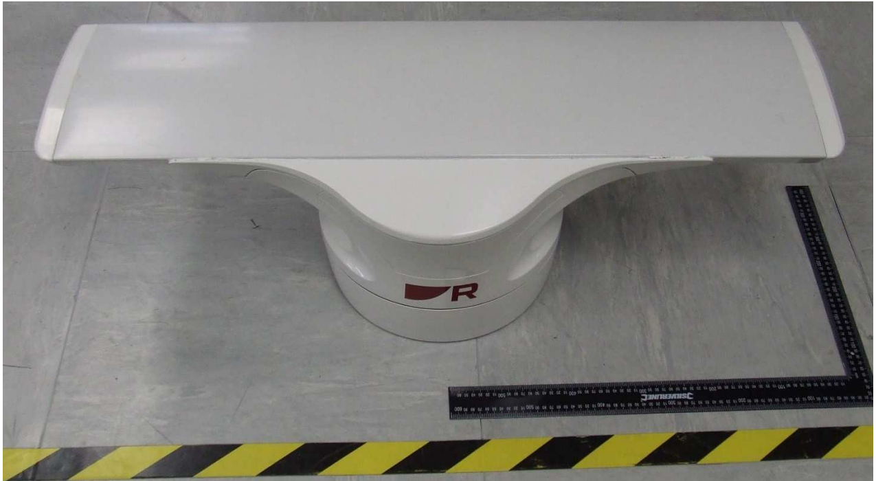
Figure 1 – Pedestal and 3ft antenna (front)

Note that both the Cyclone and Cyclone Pro share the exact same external structure.