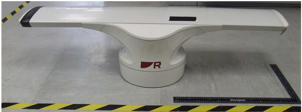
Figure 6 – Pedestal and 4ft antenna (front)