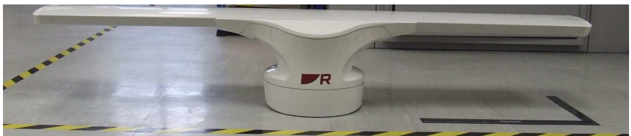
Figure 7 – Pedestal and 6ft antenna (front)