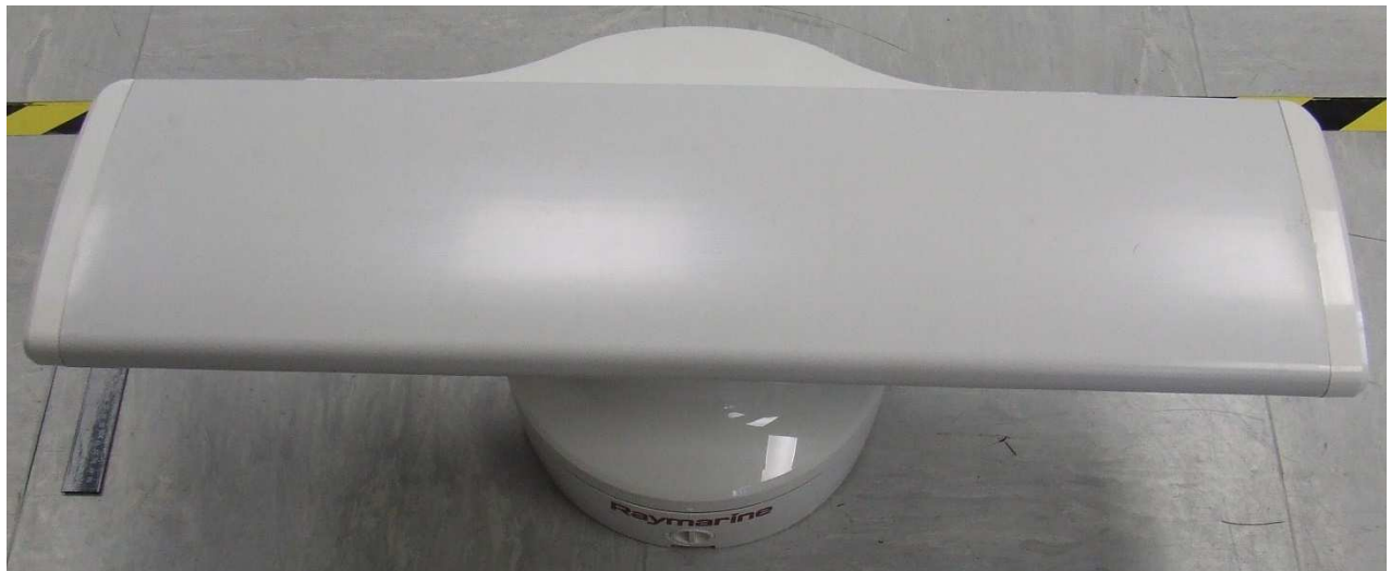
Figure 3 – Pedestal and 3ft antenna (rear)