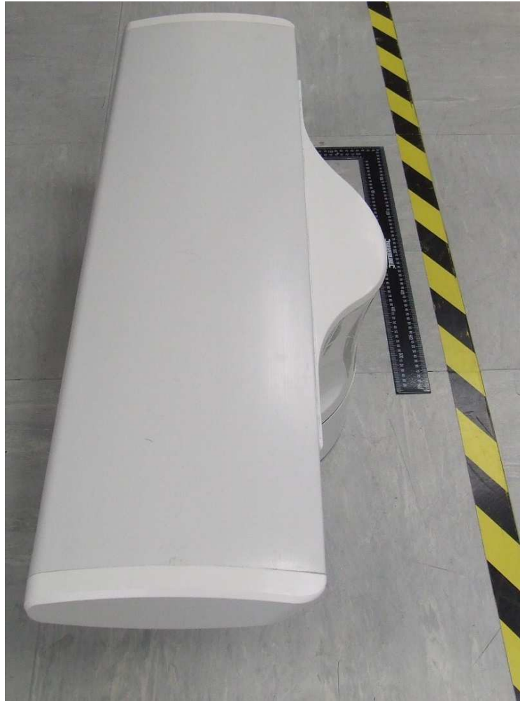
Figure 2 – Pedestal and 3ft antenna (left)