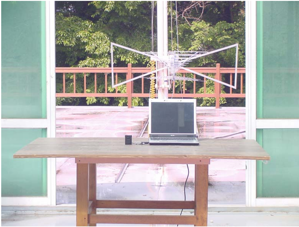
RF radiated measurement (Above 1 GHz)