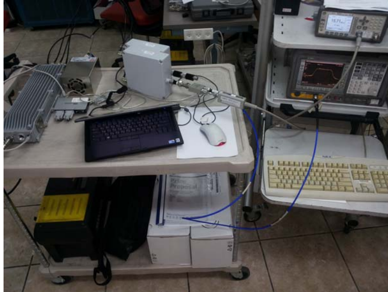
Photograph No.1 Peak output power measurement setup