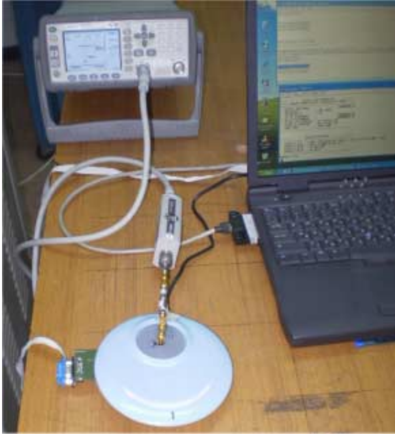
Photograph No.1 Peak output power measurement setup