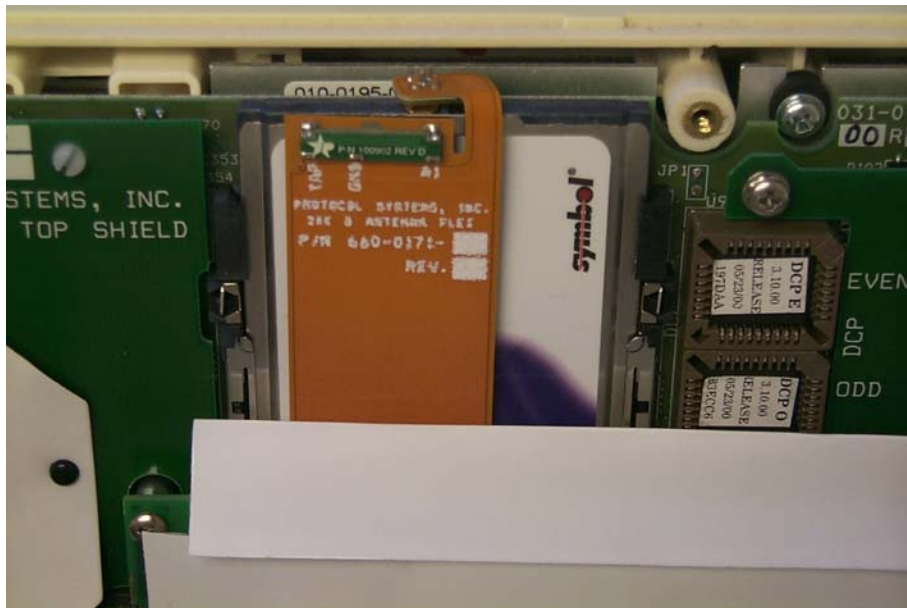
EUT with Antenna installed in PC Card Slot inside of Host Unit