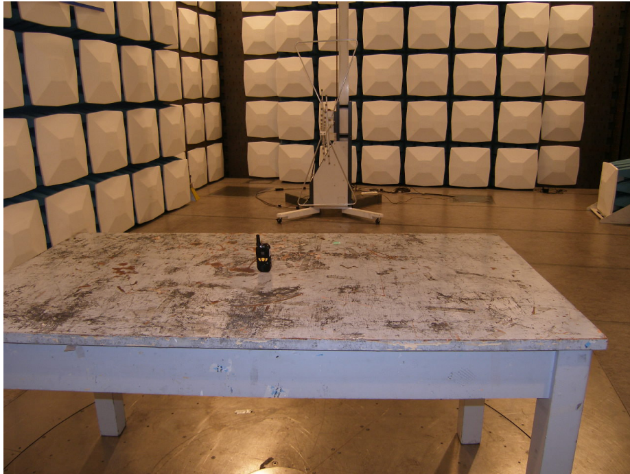
Photograph 1: Set-up for Radiation Measurement Below 1GHz