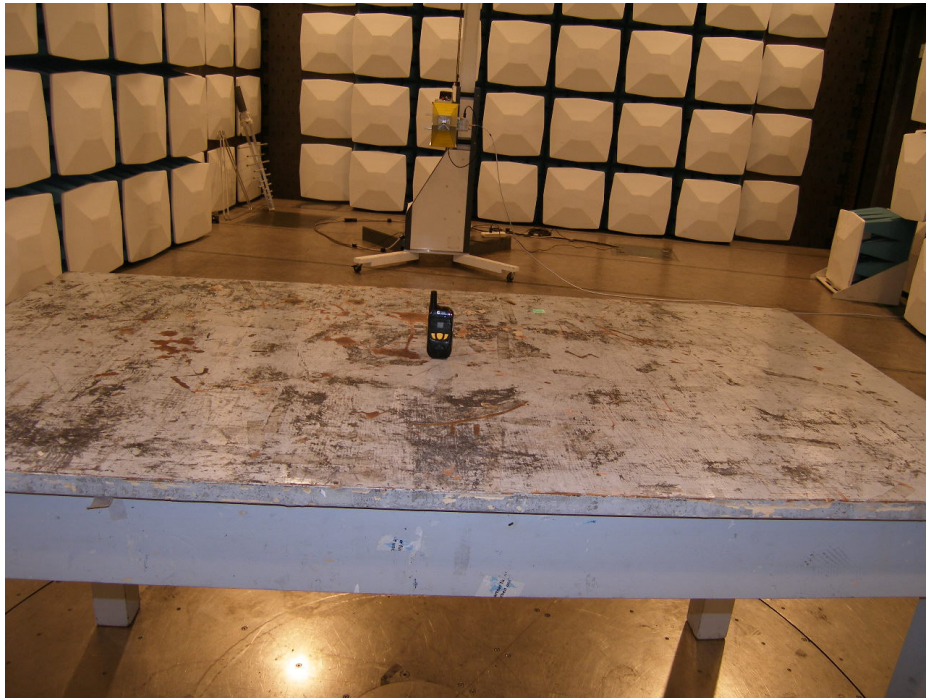
Photograph 3: Set-up for Spurious Radiation Emission Measurement below 1GHz