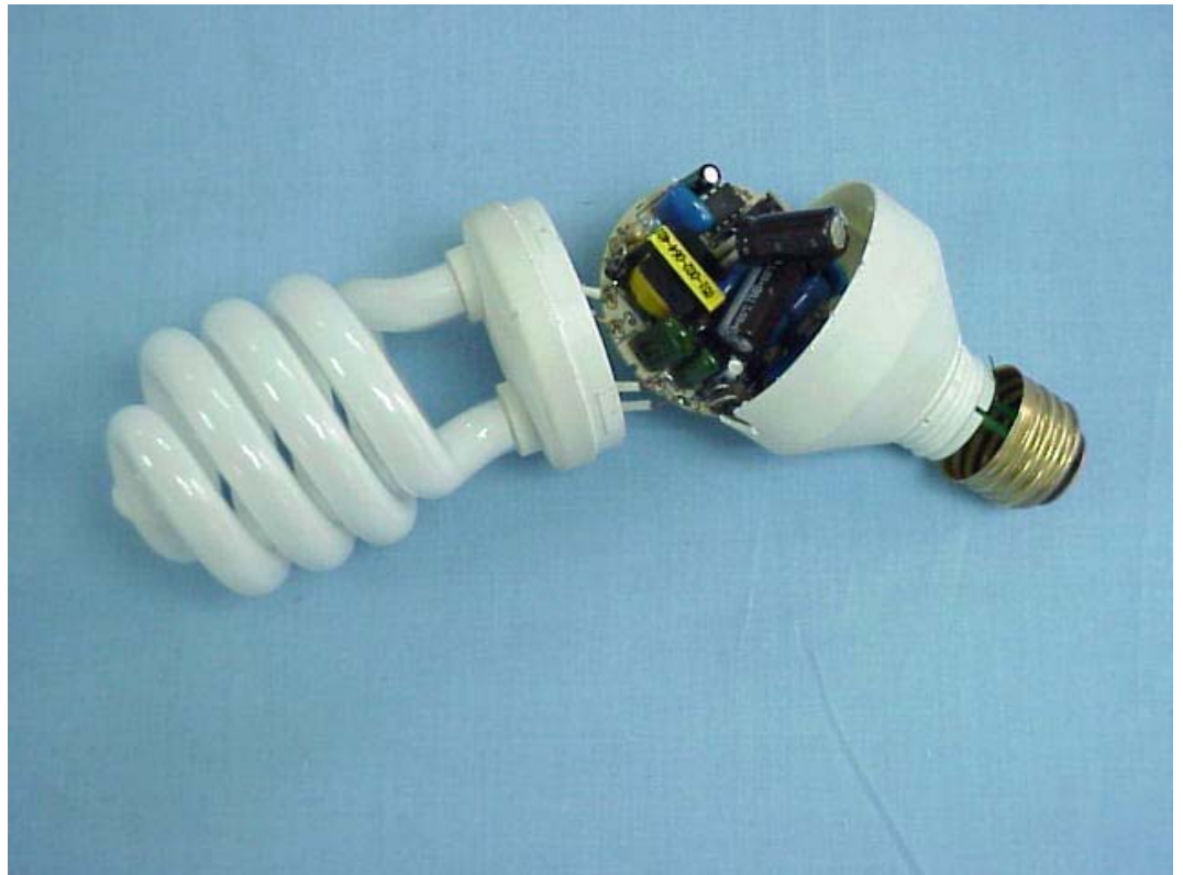
FIGURE 1 COMPACT FLUORESCENT LAMP (M/N: TP 120-25/20/13) COVER REMOVED