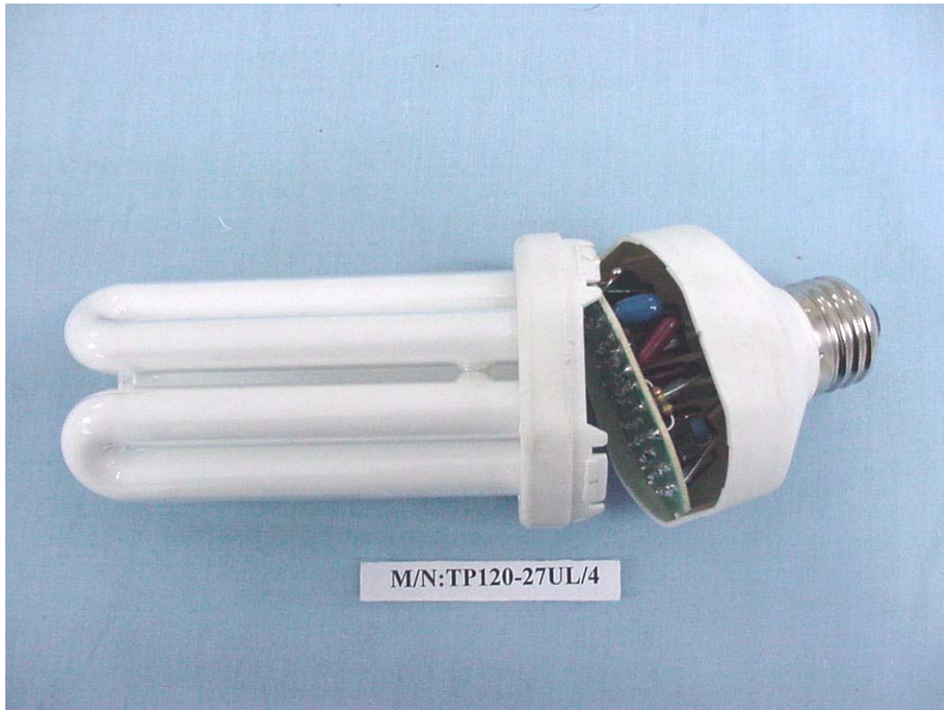
FIGURE 1 COMPACT FLUORESCENT LAMP (M/N: TP120-27UL/4) COVER REMOVED