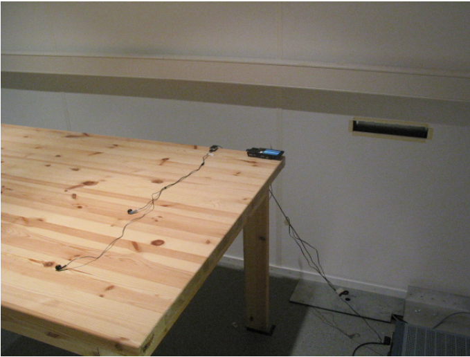
Picture 3 AC powerline conducted emission measurement Bluetooth TX / WLAN RX