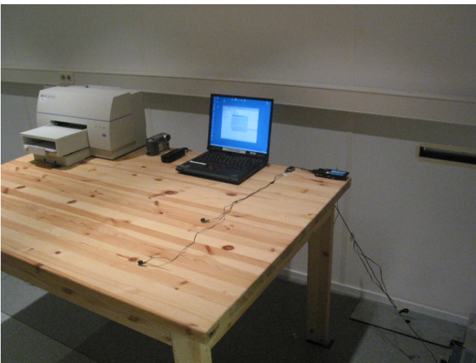
Picture 4 AC powerline conducted emission measurement GSM RX / Bluetooth TX / WLAN RX + Computer peripherals