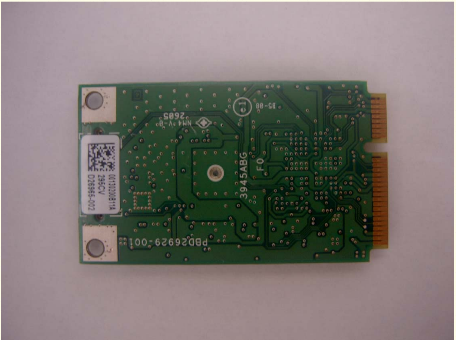
Bottom View “Insulation removed”