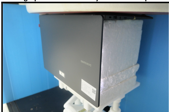
Bottom of EUT Tested at 0 mm