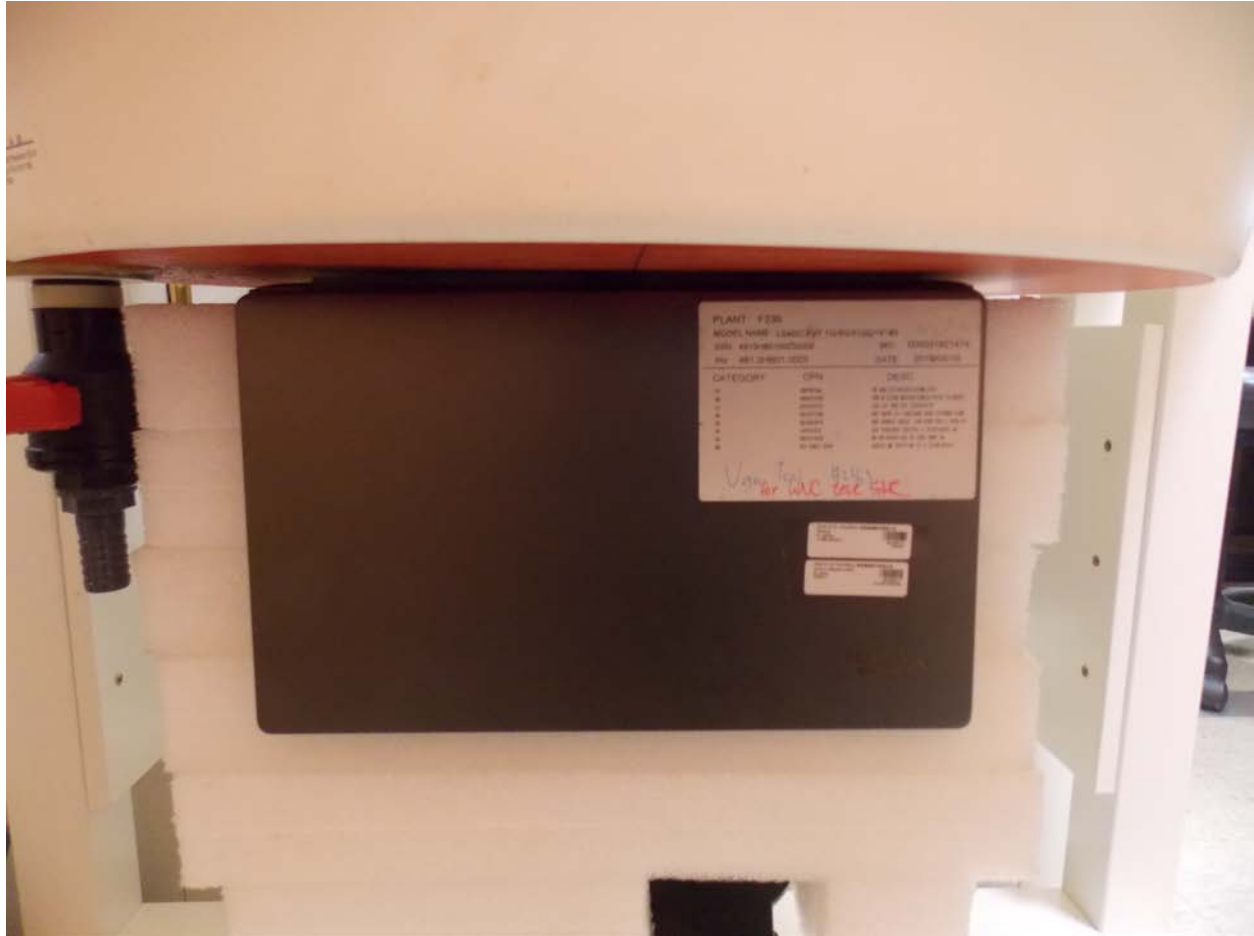
Test Position Back 0 mm Gap

Note: All Cables are removed prior to testing.