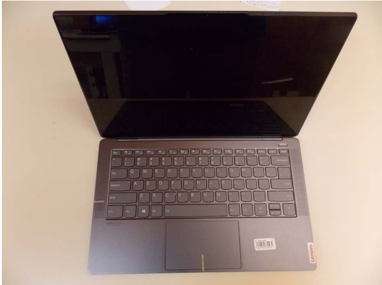
Front of Device Laptop Mode