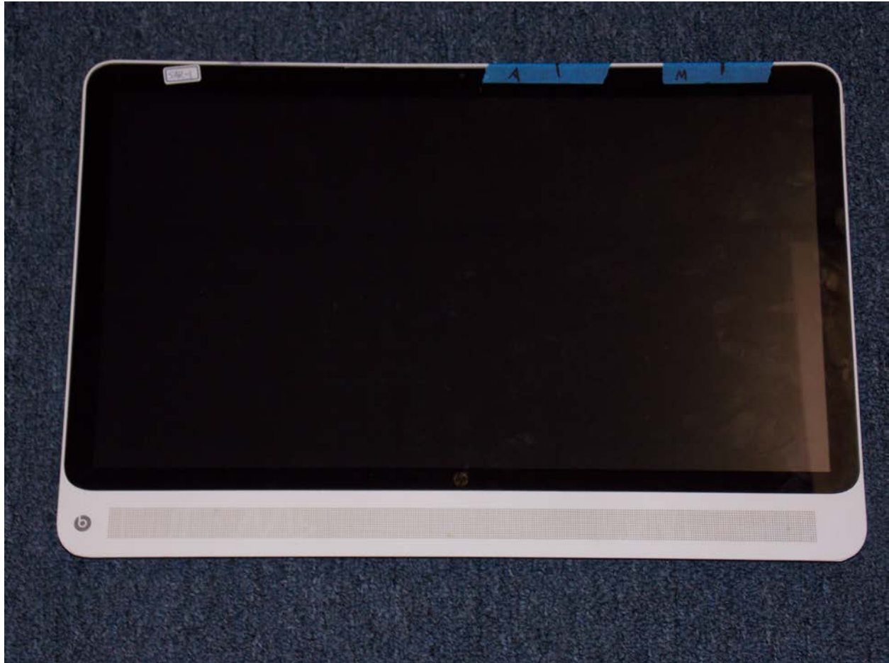
Front of Device