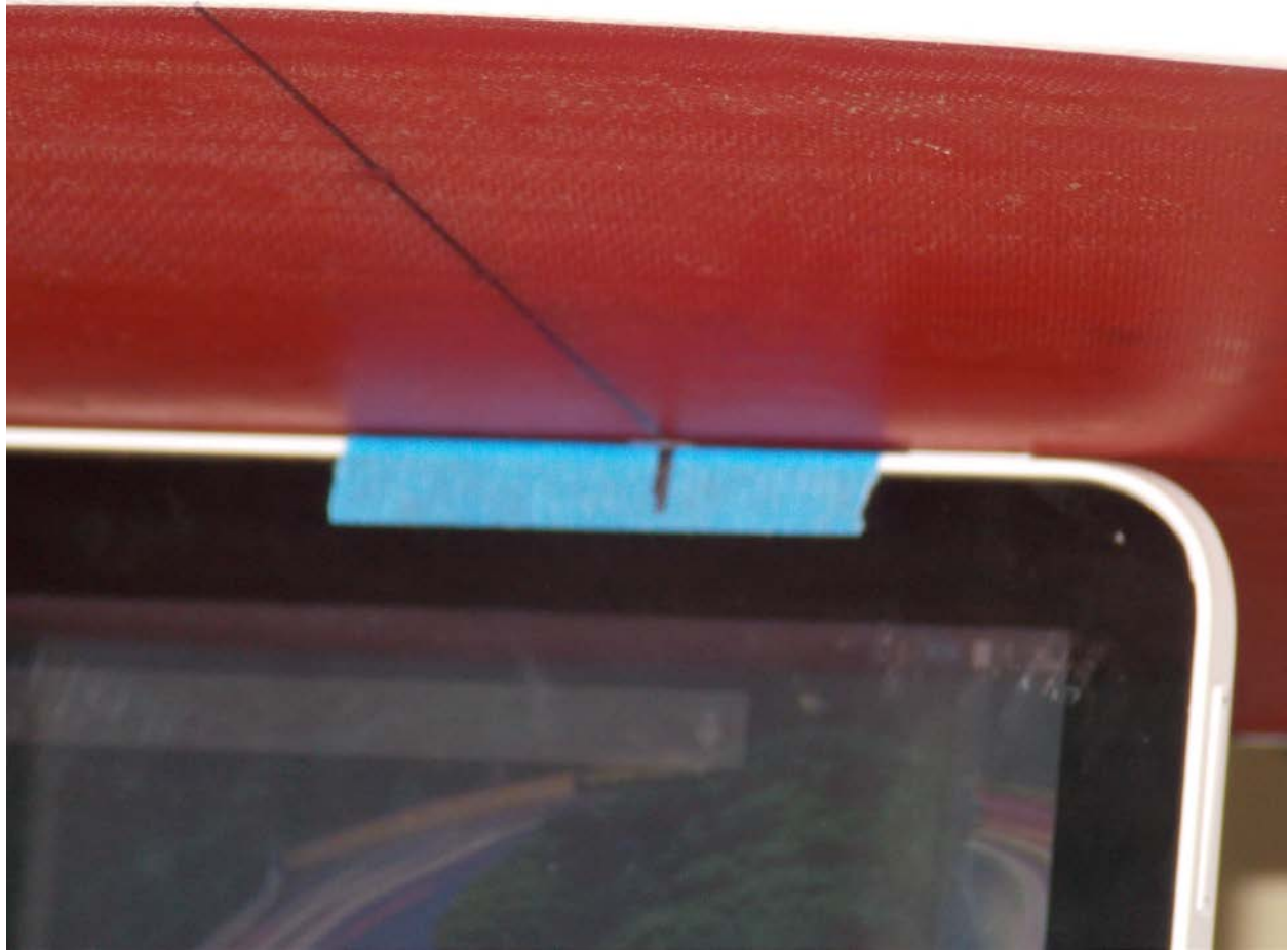
Test Position Tablet Edge 0 mm Gap