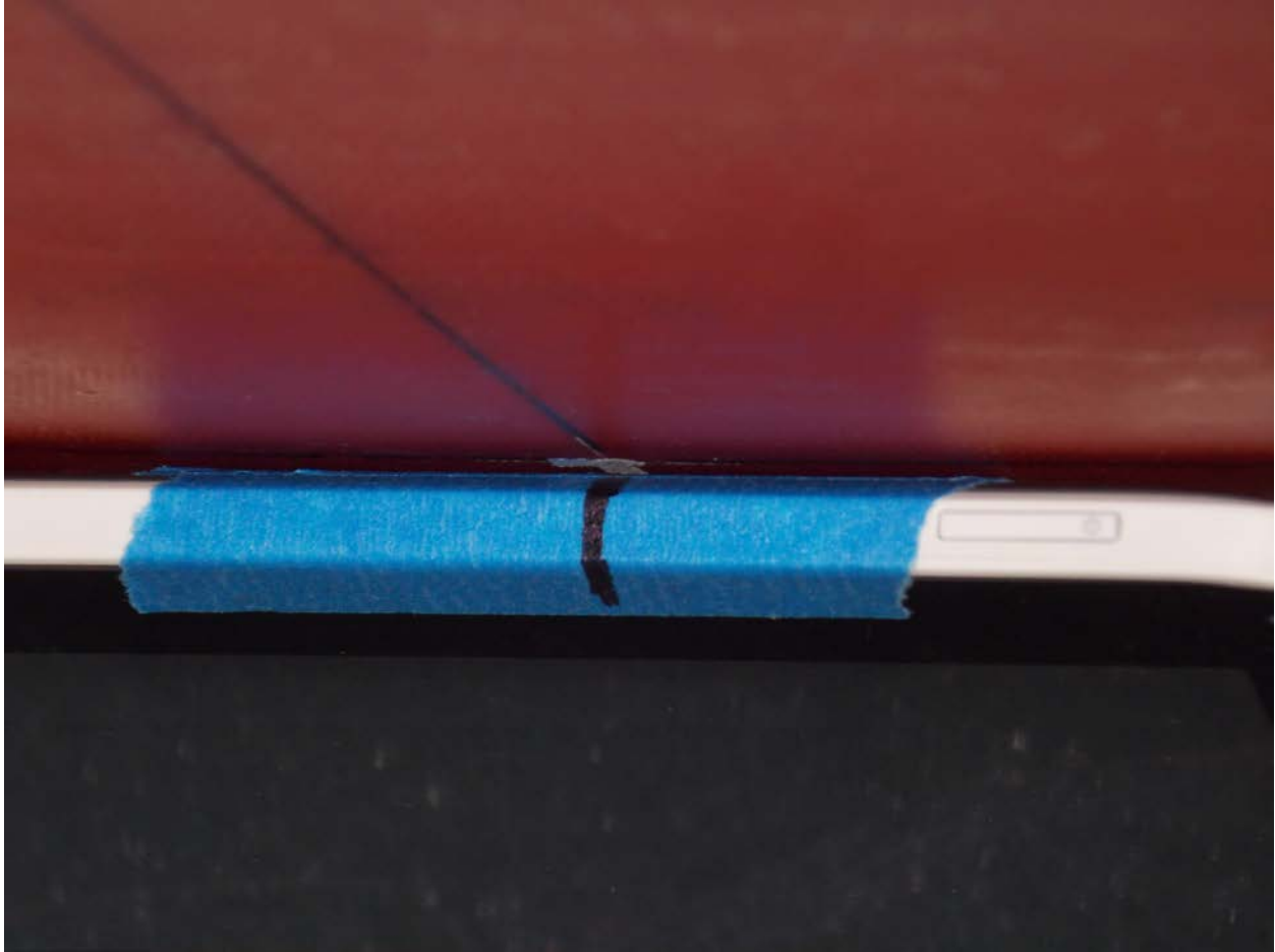
Test Position Tablet Curved 0 mm Gap