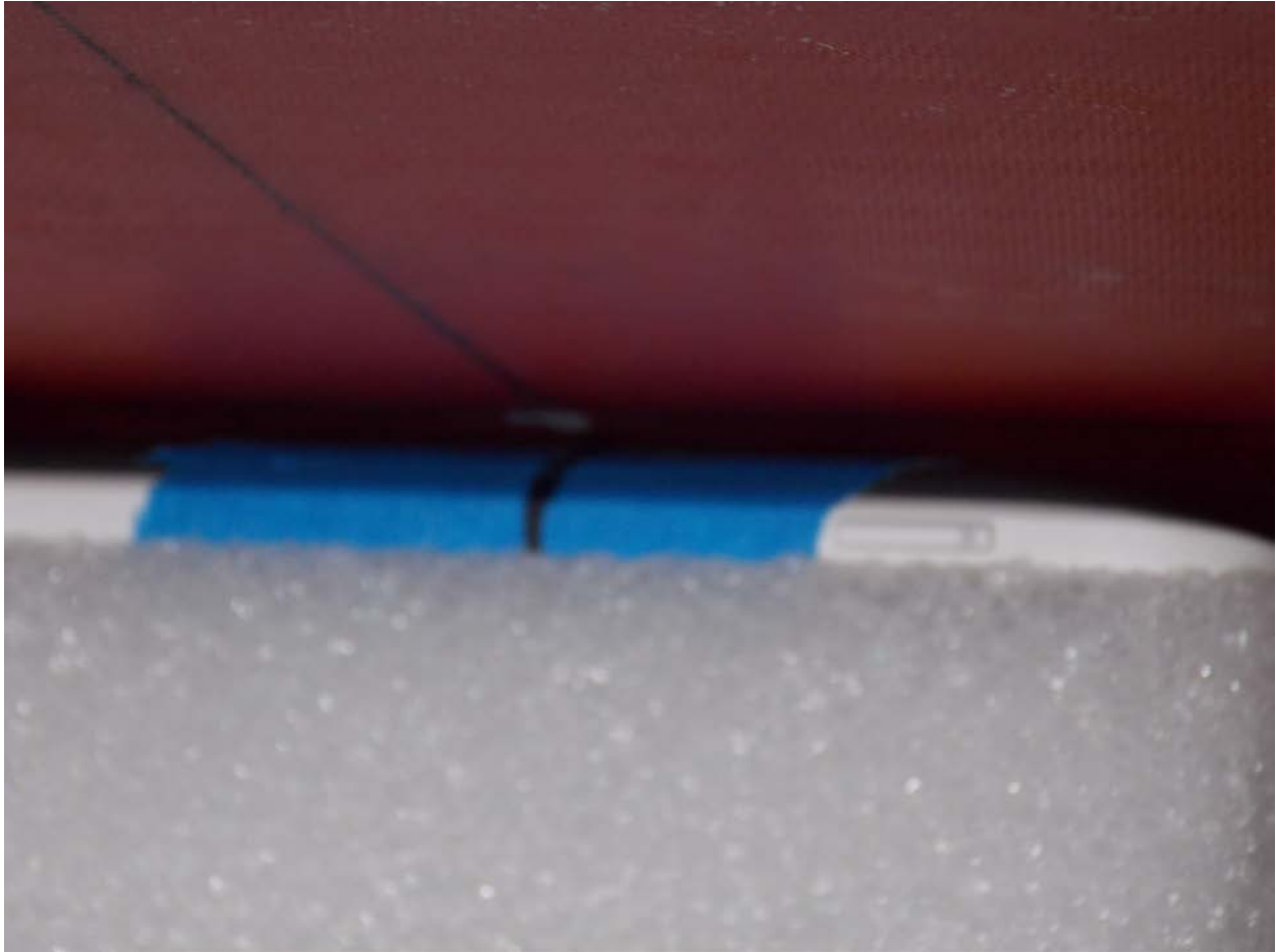
Test Position Tablet Back 0 mm Gap