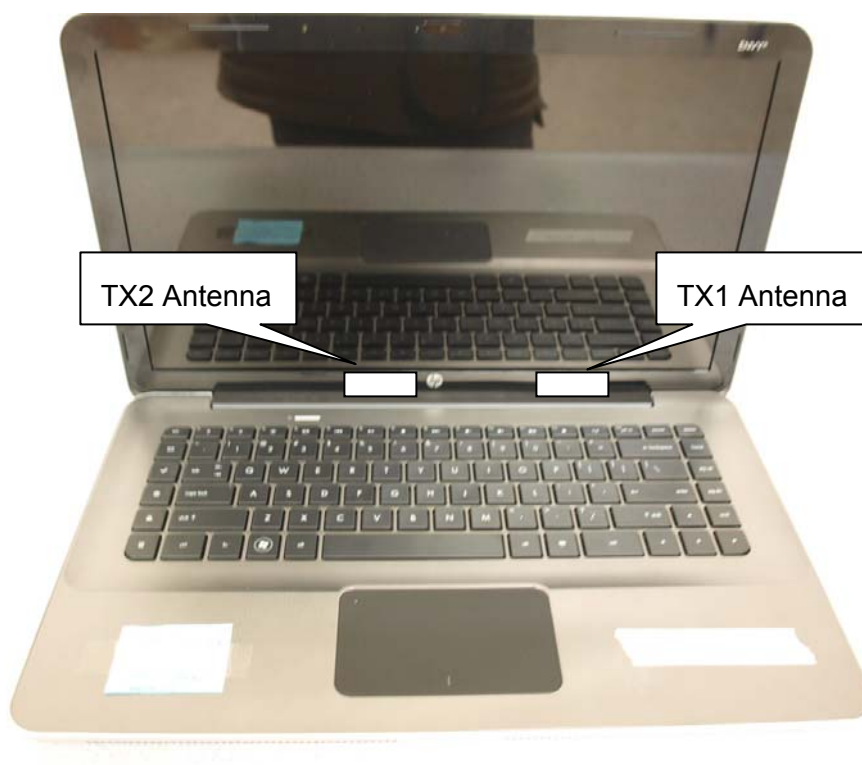
HP NIKITA 1.1