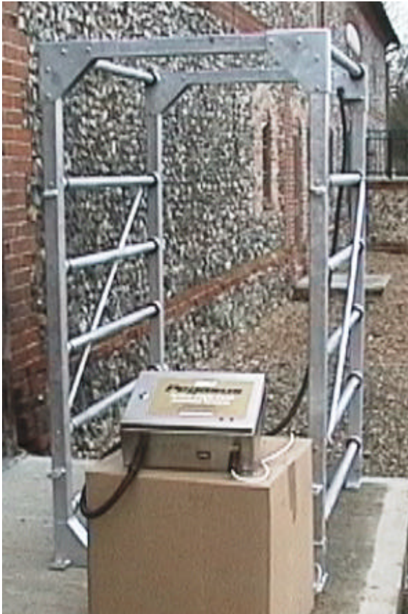
Antenna Connected to Control Box