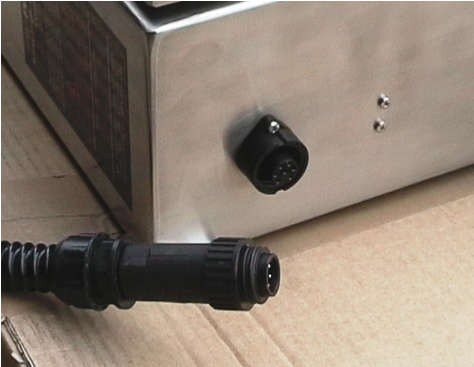
Antenna Connector - 7 Pin Circular, Weatherproof Connector.