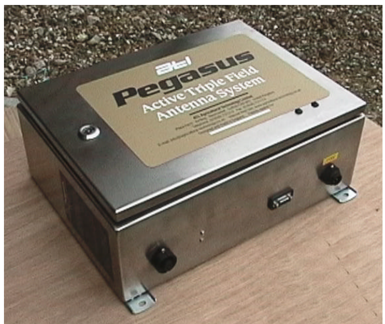
Pegasus Control Box