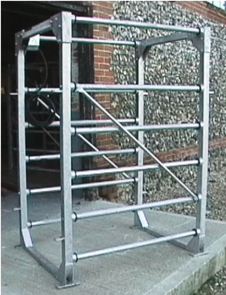
Pegasus Active Triple Field Antenna