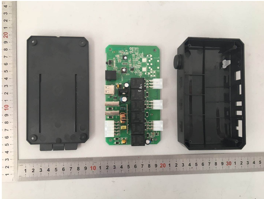
EUT – PCB Top View