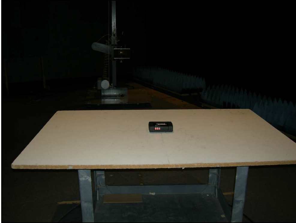
Figure 2: Radiated Emissions – XPOS