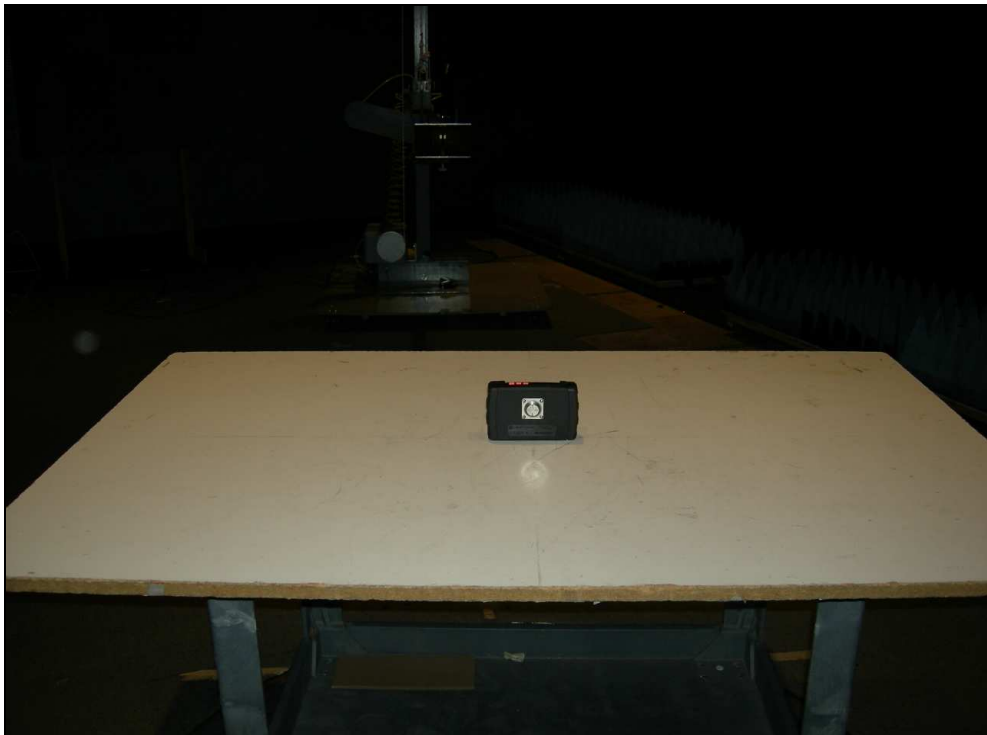
Figure 4: Radiated Emissions – YPOS