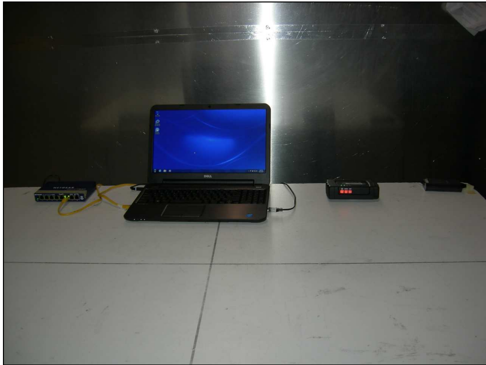
Figure 7: Conducted Emissions