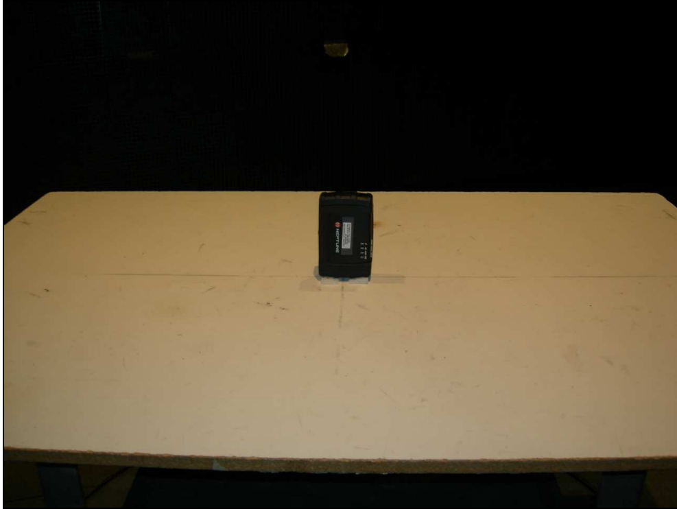
Figure 5: Radiated Emissions – ZPOS