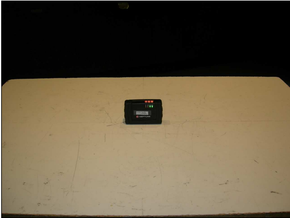
Figure 3: Radiated Emissions – YPOS