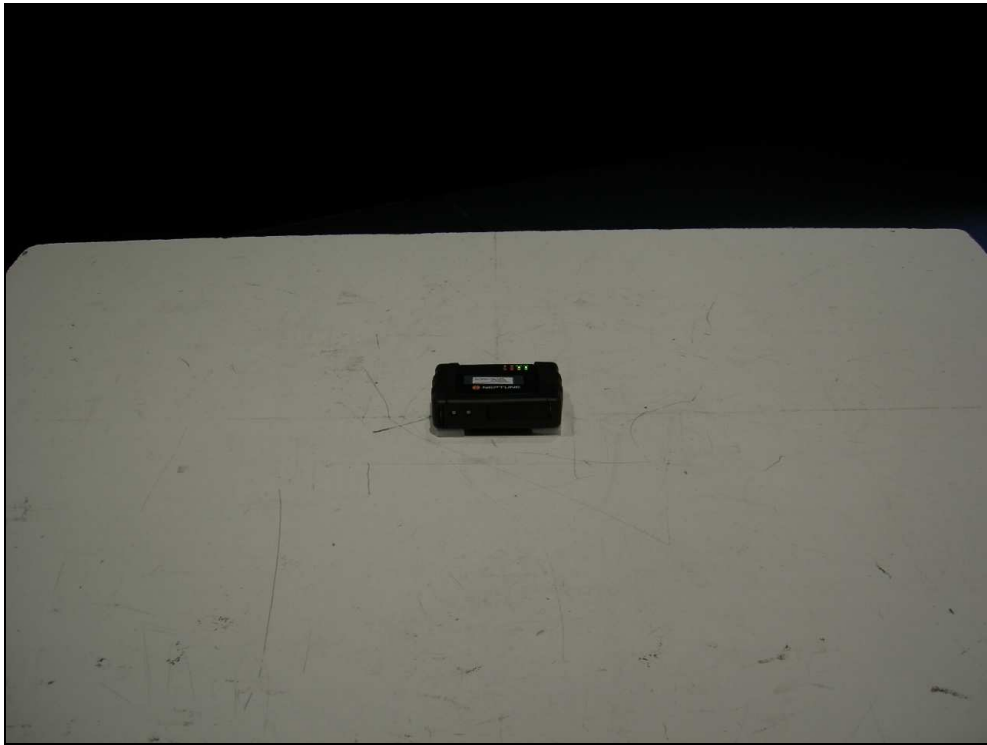
Figure 1: Radiated Emissions – XPOS