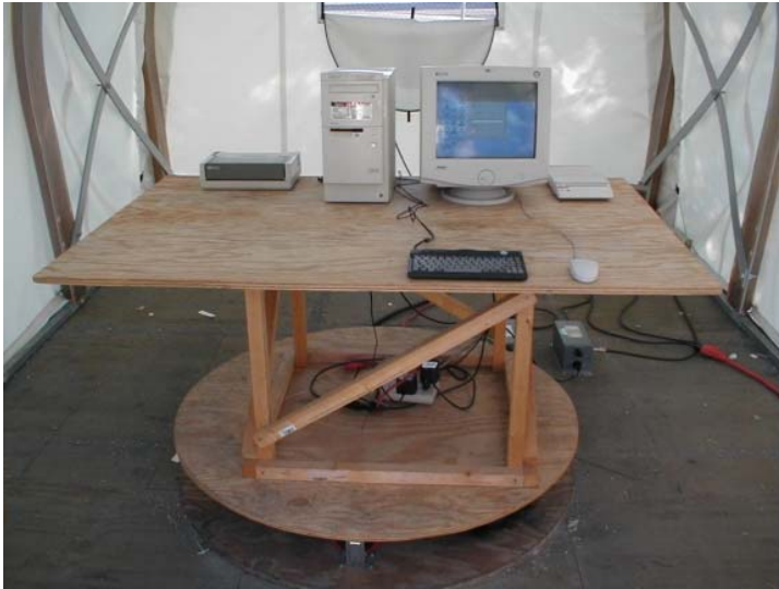
Conducted Emission Photograph – Rear View