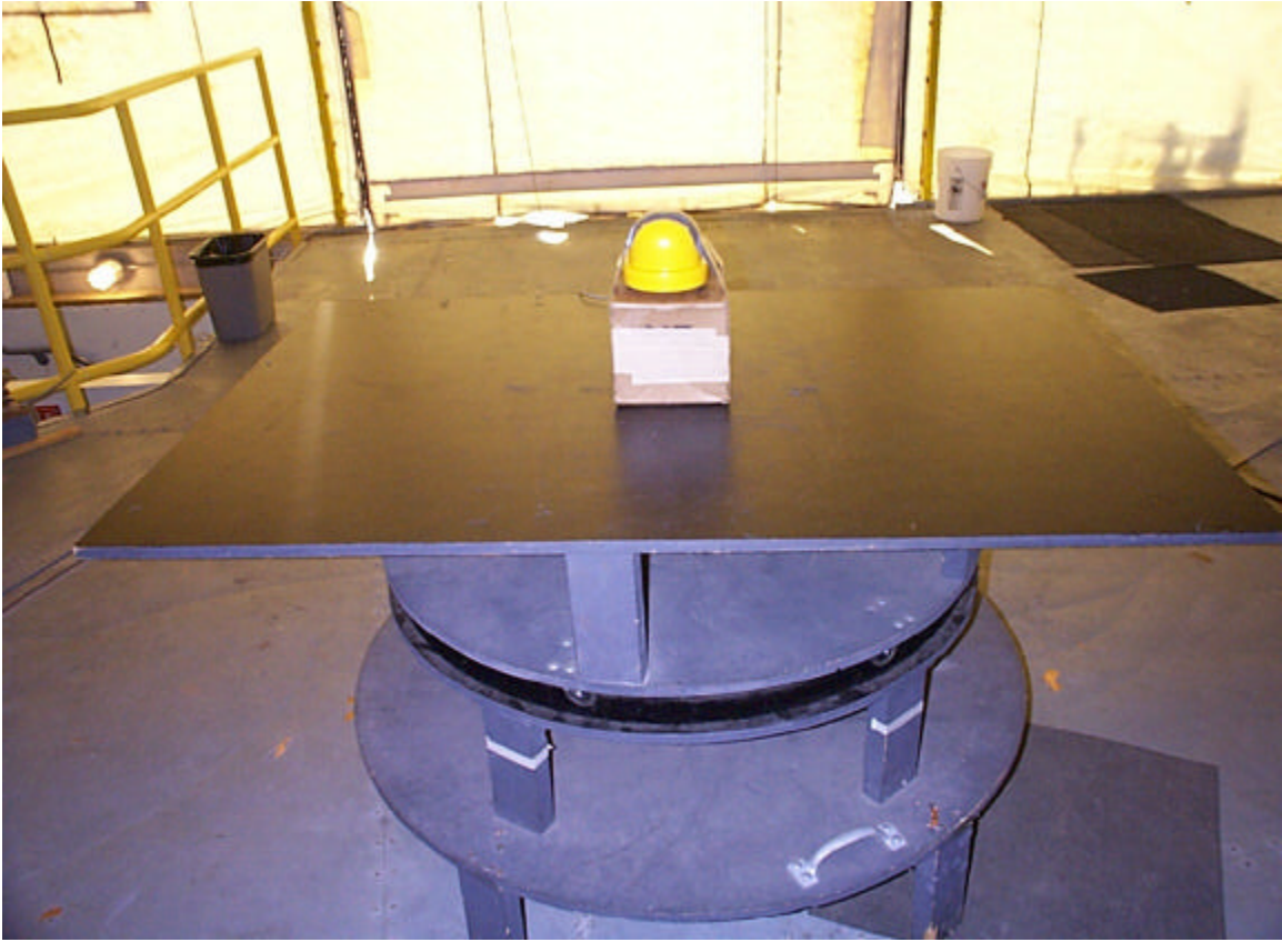
Radiated Emissions setup front View