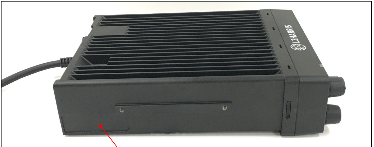
ID label location on left side of EUT