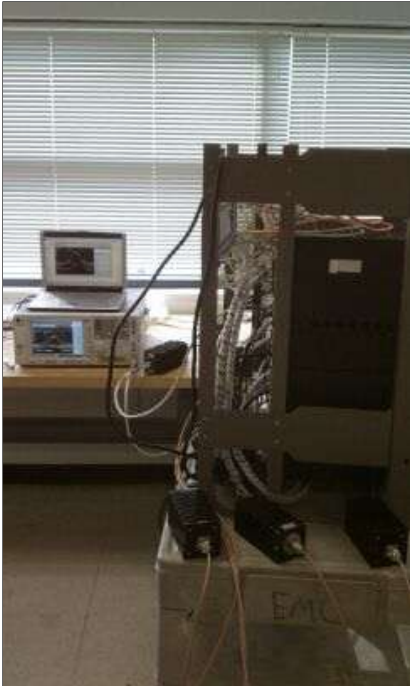
Photograph 3. Conducted RF Power, Test Setup