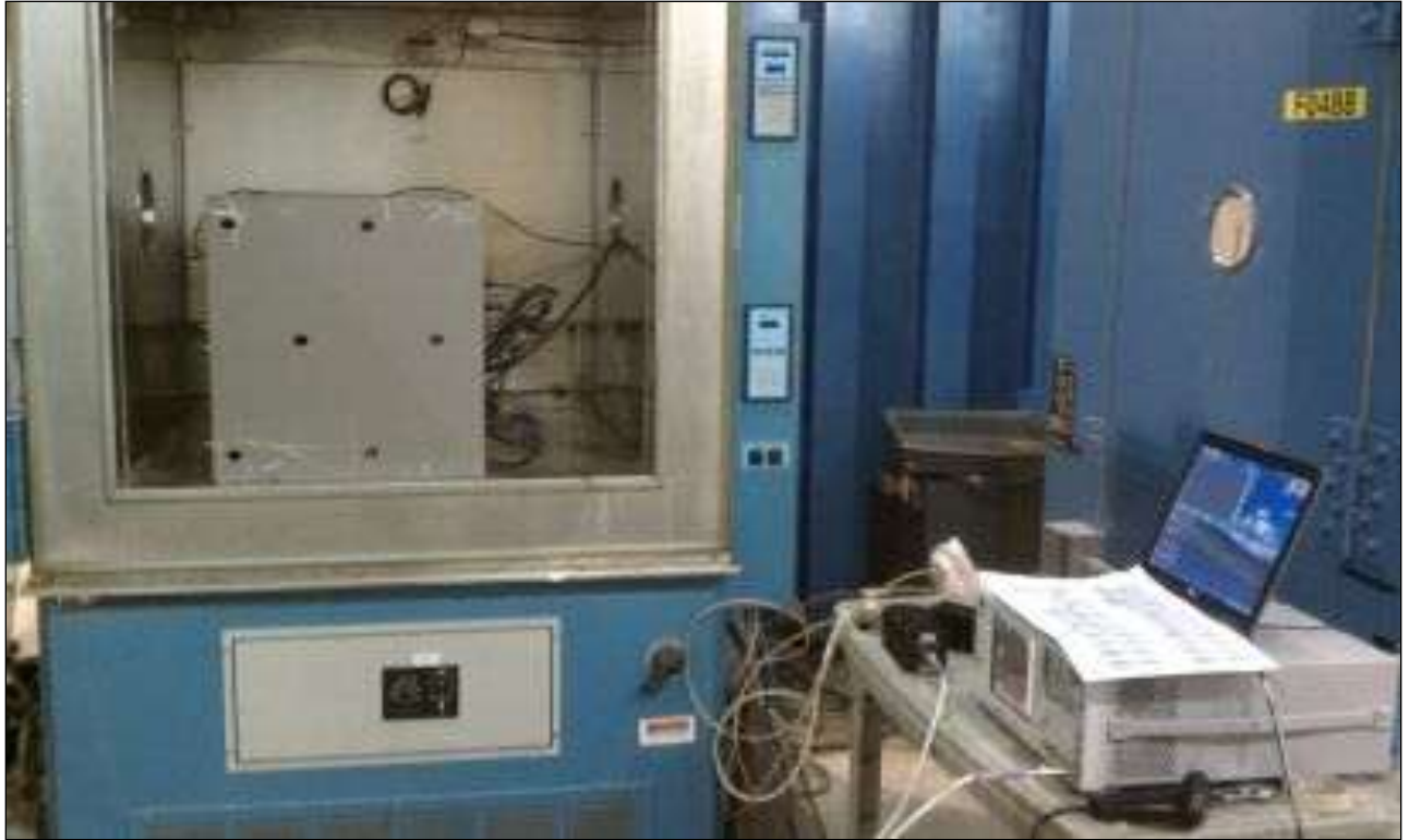
Photograph 4. Frequency Stability, Test Setup