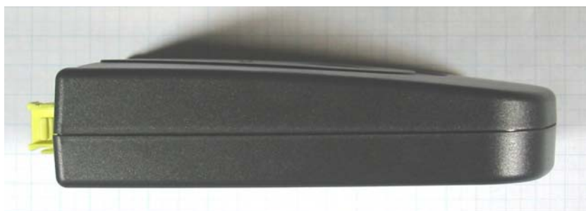
Figure 4: side view