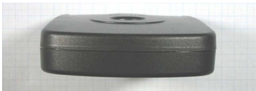
Figure 5: backside view