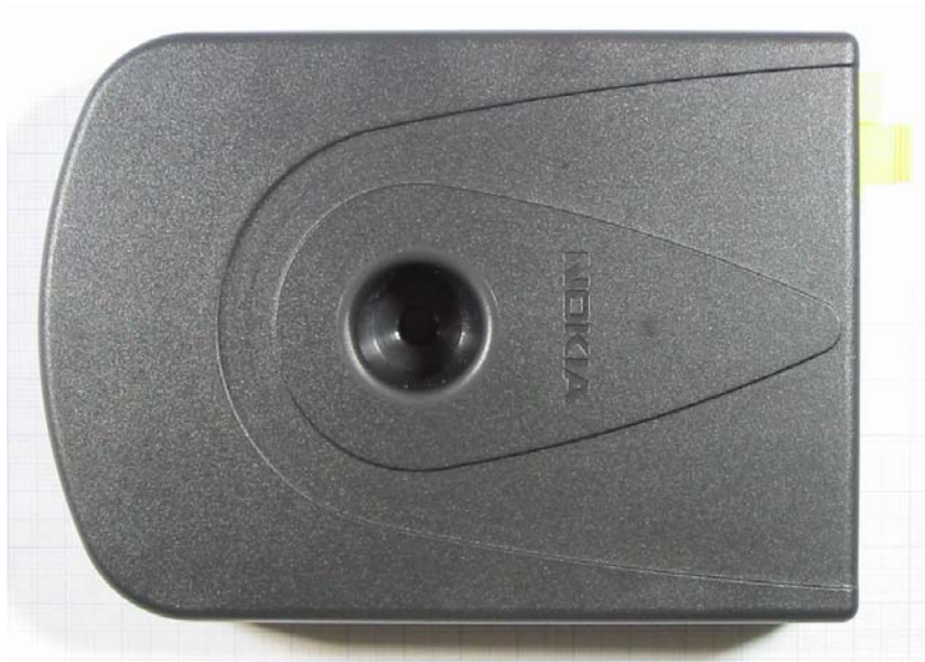
Figure 1: Cover A (top view)