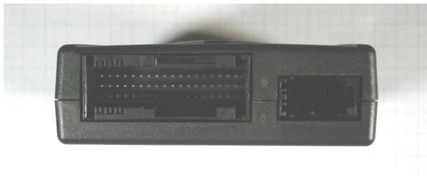
Figure 3: Connection panel (front view)