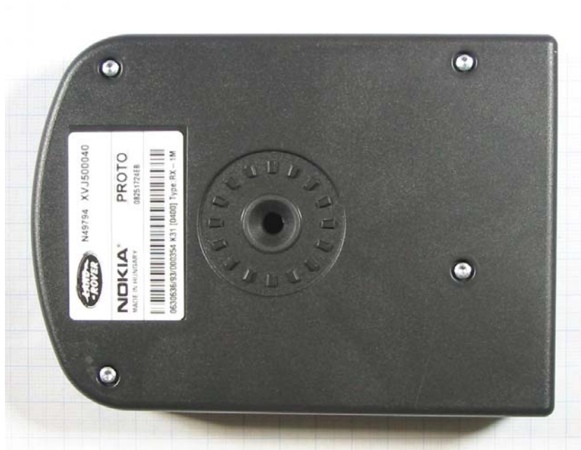
Figure 2: Cover B (bottom view)