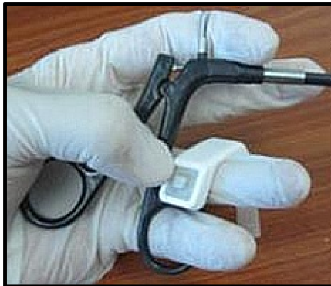
Photograph 1: AutoLap CU Ring general view

Photographs of the exterior appearance of the CU Ring and its packaging are provided. The FCC identifier and a label will not be placed on the device itself for two reasons. First, the CU Ring is so small as to make placing the label on it is impracticable (Photograph 1). Second, the CU Ring is a disposable unit, will be always within its packaging including the time of purchase, until the time of use in a sterile environment. Having the label on the CU Ring would be of little use.