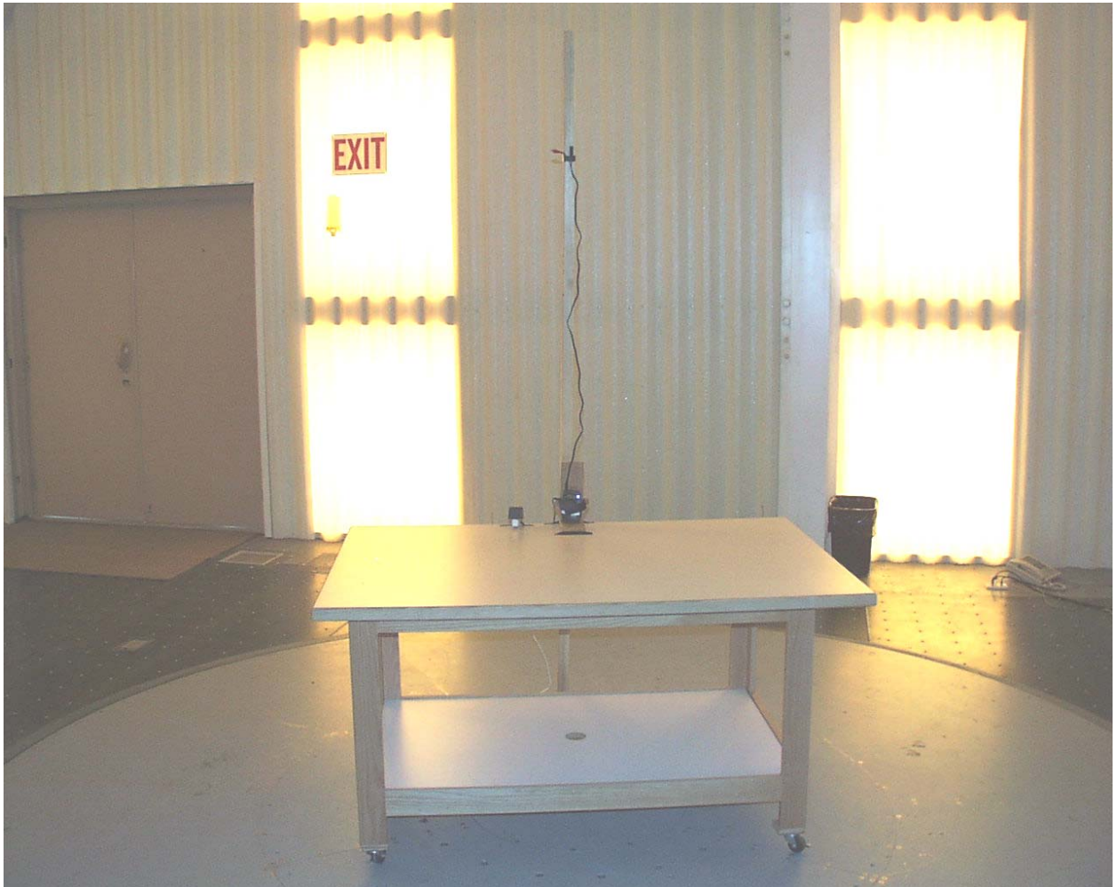
Front View Radiated Emission Configuration (Vertical Orientation)