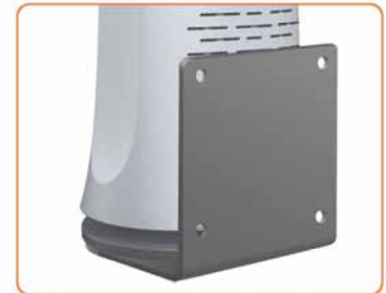
Additional metal plate for wall mounting.