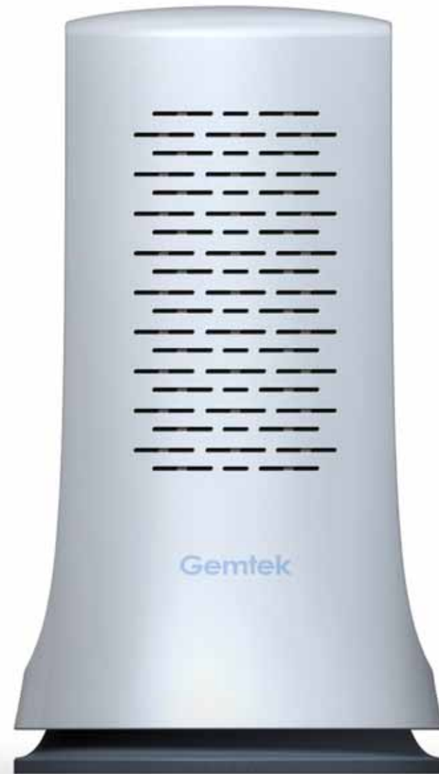
New Version : L*H=116*208