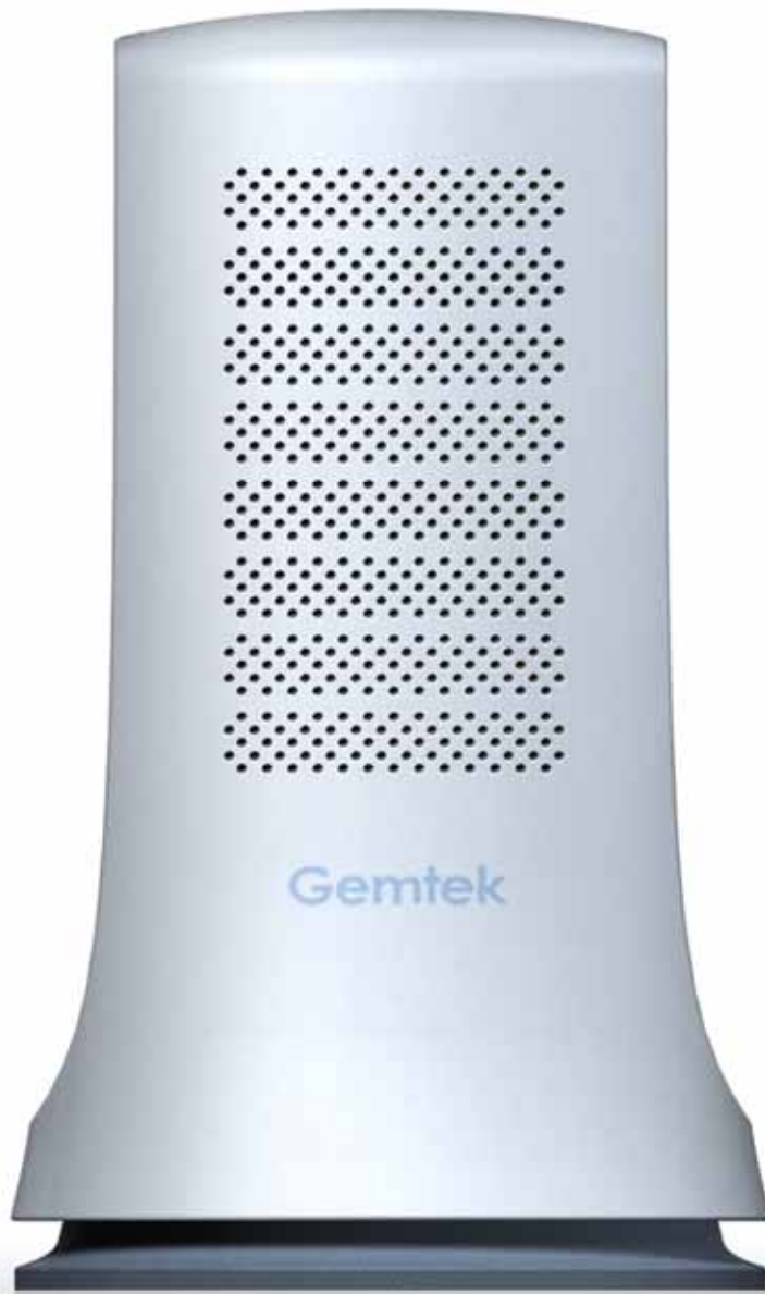
Old Version : L*H=131*222