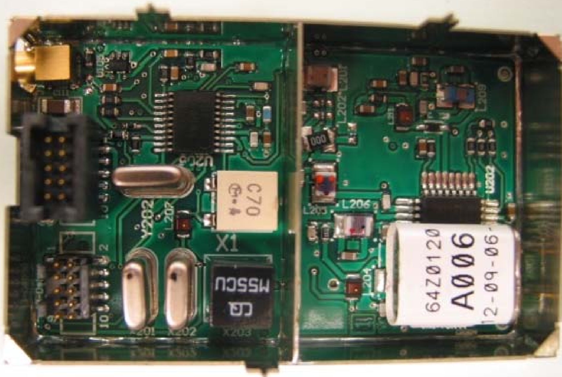
MCDR top pcb with shield