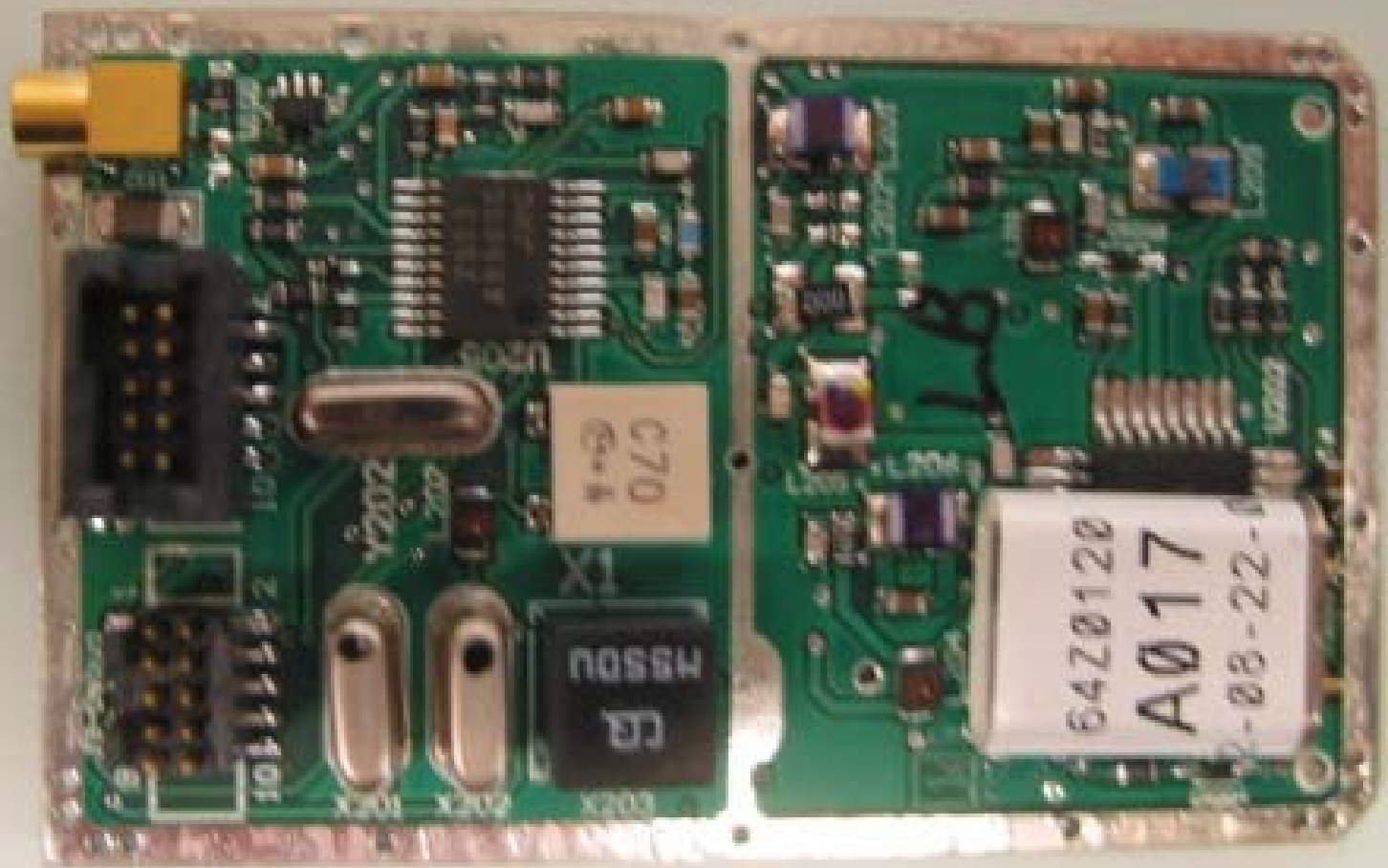
MCDR board top without shields