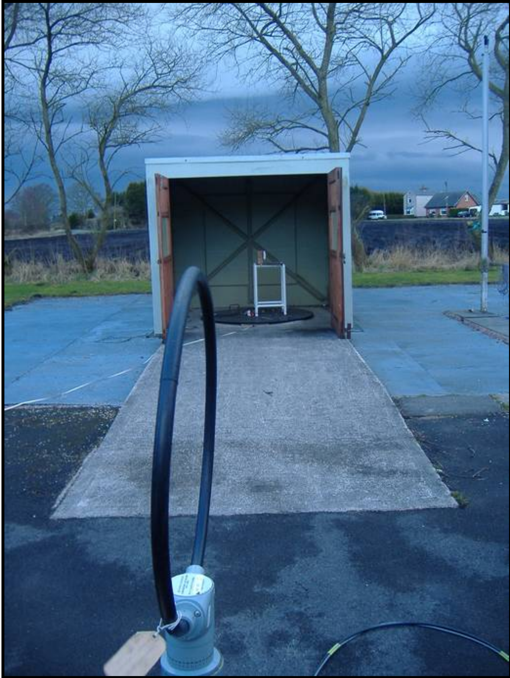
H Field Test Setup