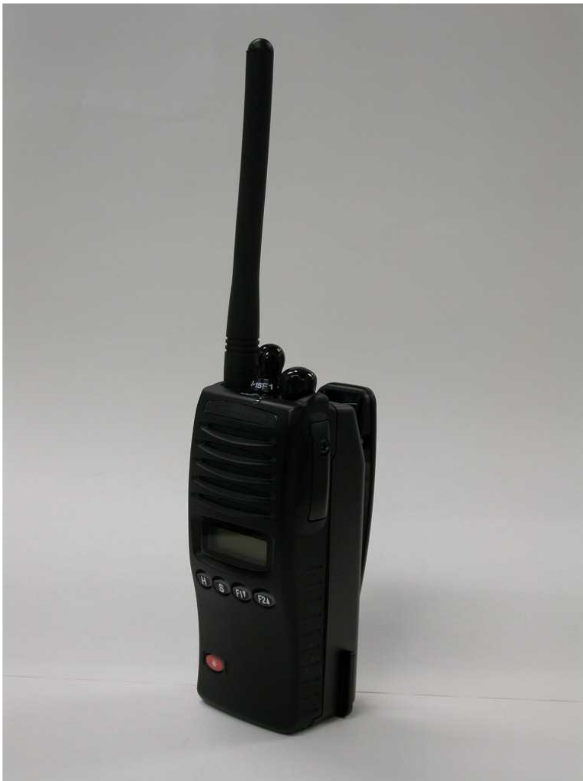
1) Model view of SC-281A – Front Three- Quarter View 1