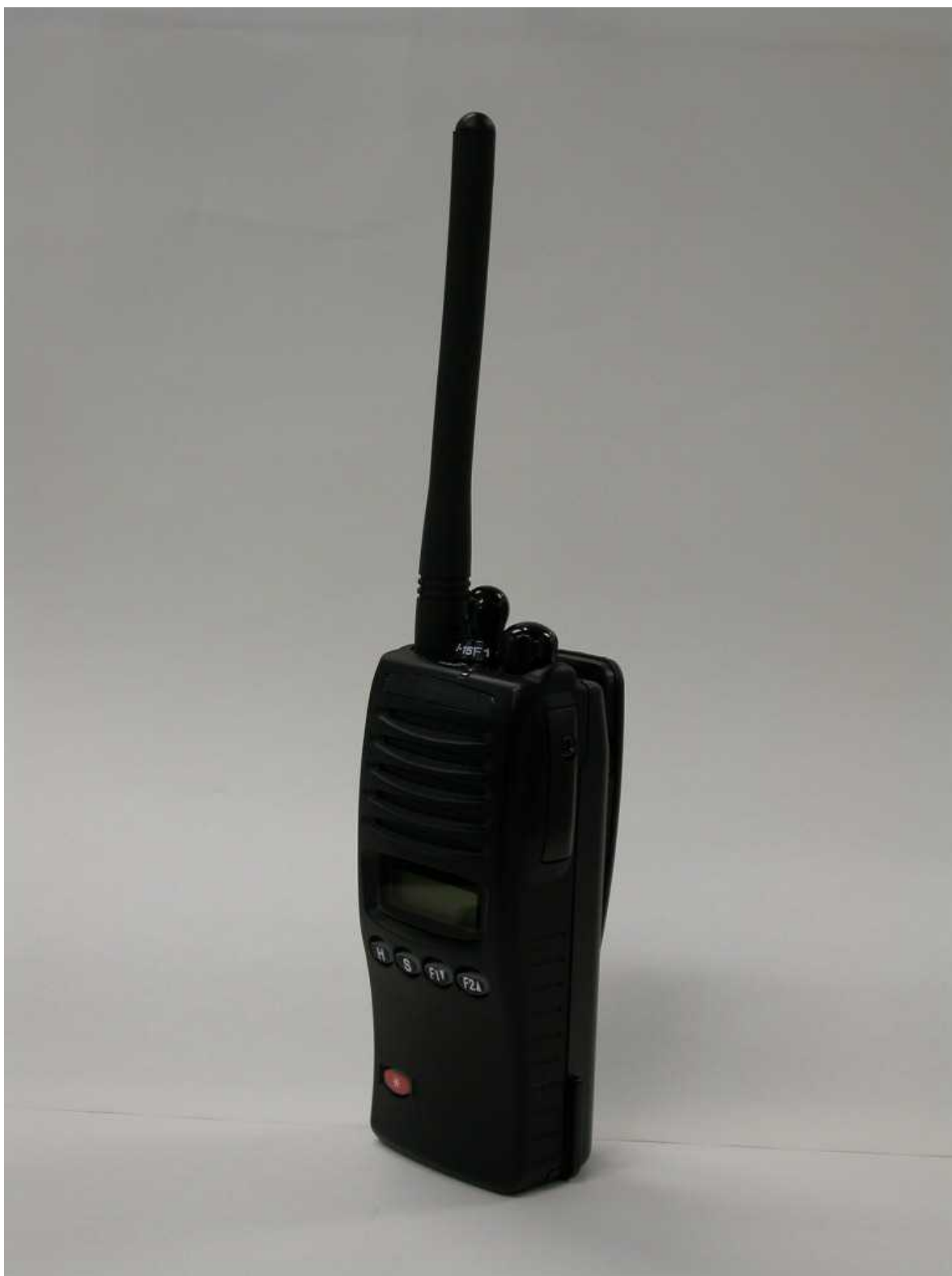
1) Model view of SC-281 A – Front Three- Quarter View 1